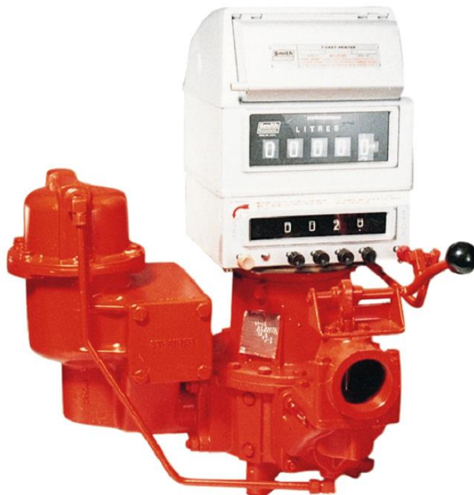
Smith Meter Inc Model T-11 Flowmeter With Veeder-Root Indicator, Printer, Pre-set and Air Sense System Control