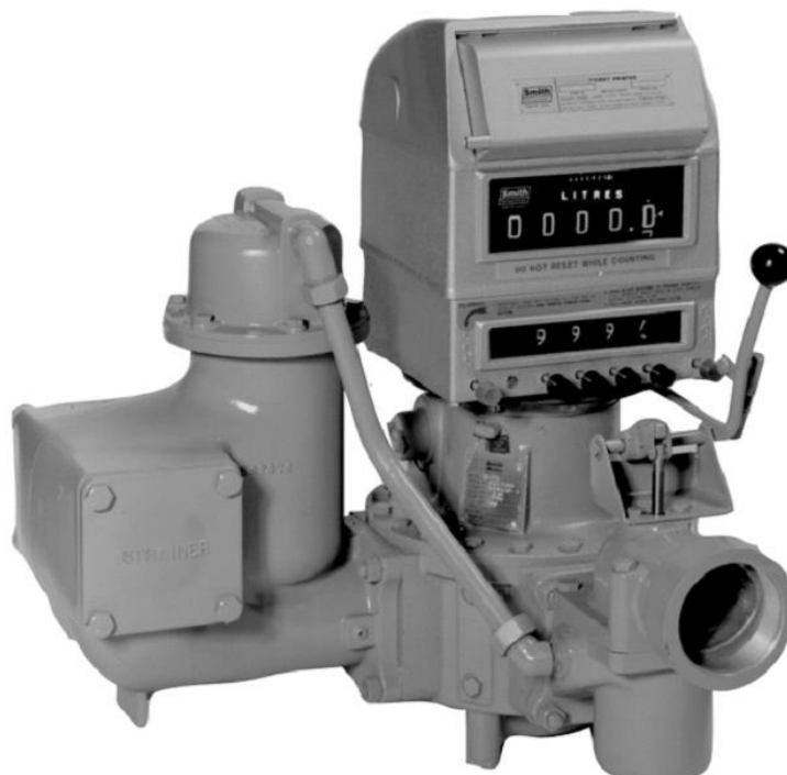
Smith Meter Inc Model T-20 Flowmeter With Veeder-Root Indicator, Printer, Pre-set and Air Sense System Control