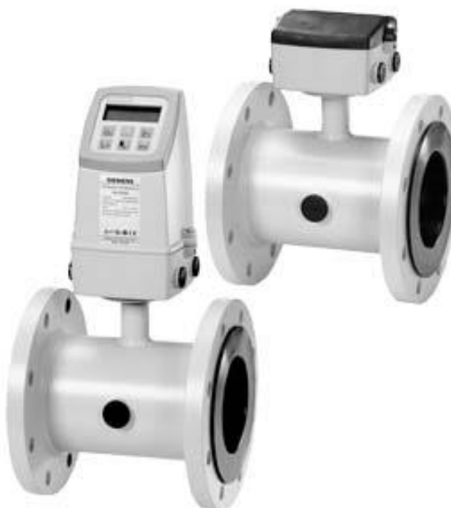
Siemens Model MAG 5000CT/6000CT DN50 Water Meter (compact & remote version (Variant 9))