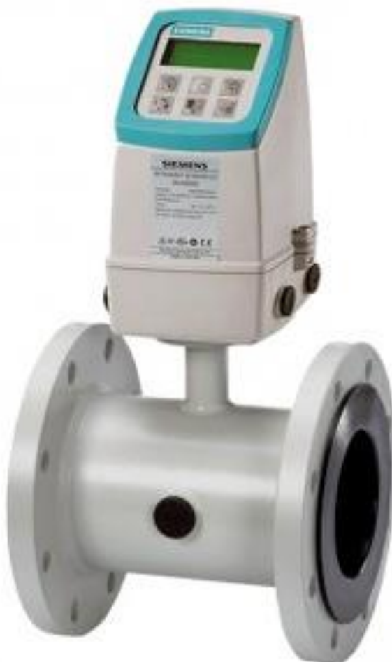
Siemens Model MAG5100W with MAG6000CT water meter (The Pattern)