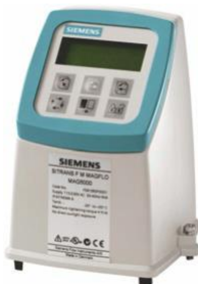
SITRANS F M MAG5000CT/6000CT signal transmitter (Variant 9)