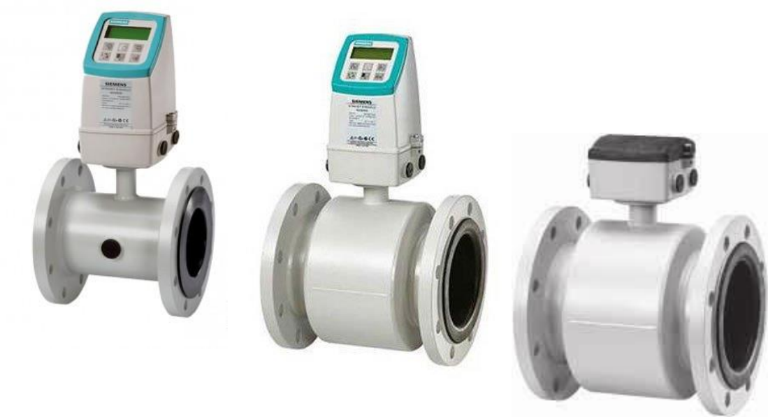
Showing Different Size Meters MAG5000CT/6000CT (Various Variants)