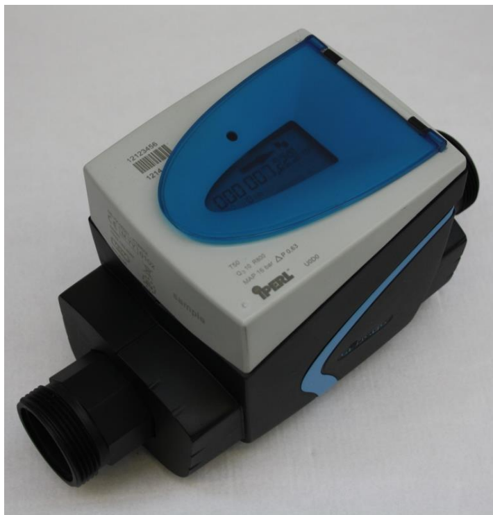
Sensus Model iPERL DN32 Water Meter