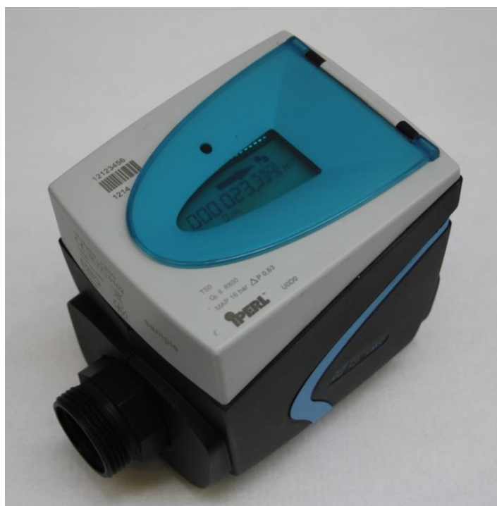
Sensus Model iPERL DN25 Water Meter