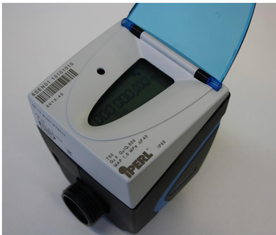
Sensus Model iPERL DN20 Water Meter (The Pattern)