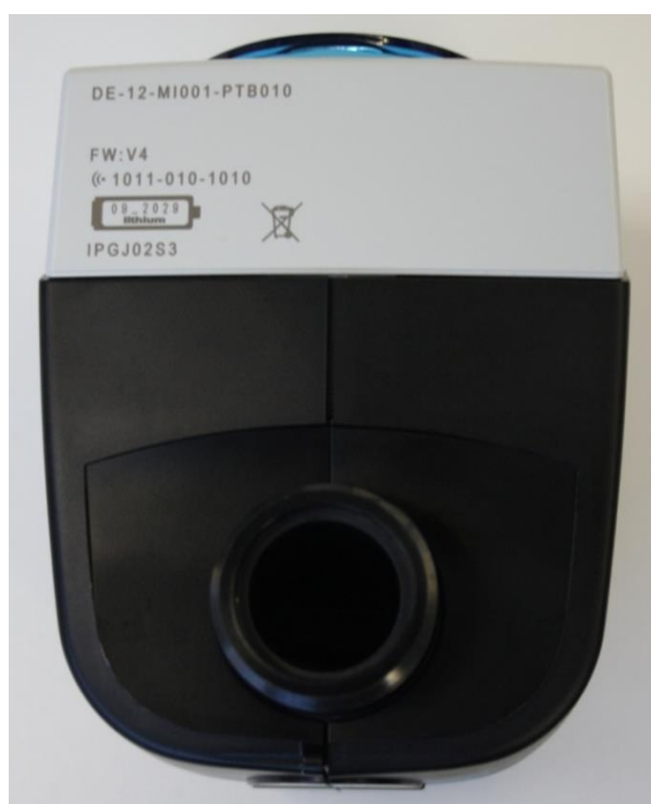
Sensus Model iPERL DN20 Water Meter (The Pattern – End View)