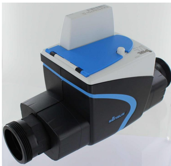
Sensus iPERL169 DN40 – Variant 4