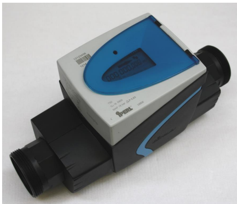
Sensus Model iPERL DN40 Water Meter