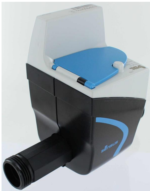
Sensus iPERL169 DN20 – Variant 4