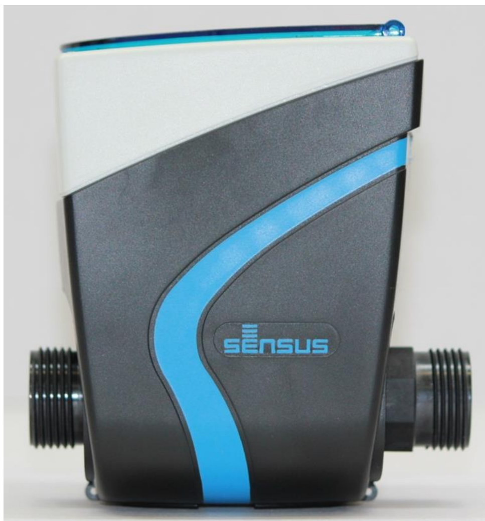
Sensus Model iPERL DN20 Water Meter (The Pattern – Side View)