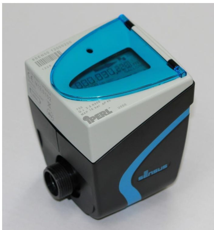
Sensus Model iPERL DN15 Water Meter