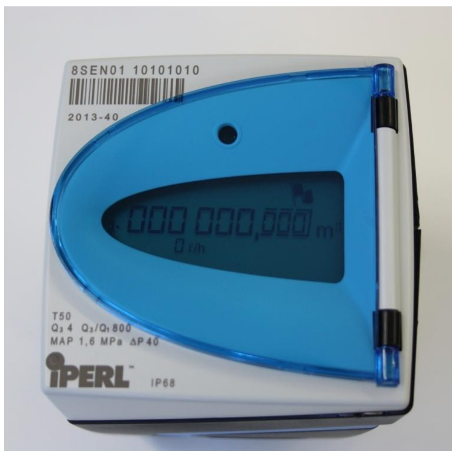
Indicating Device and Markings