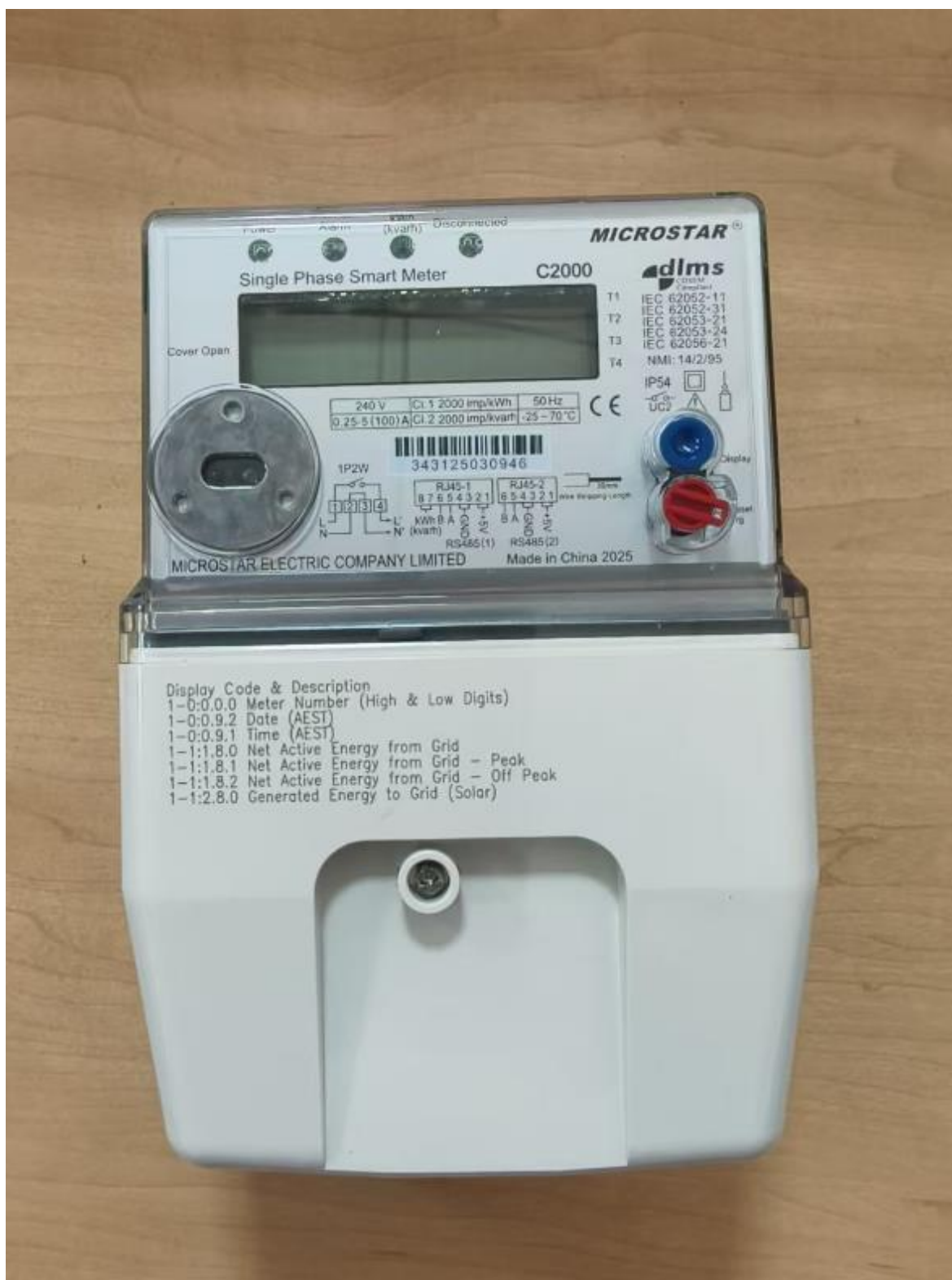
Microstar Model C2000 (Variant 3)