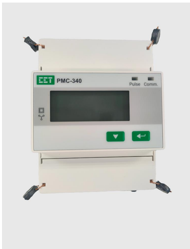
CET Electric Technology Inc. model PMC-340-A6 Class 1 Electricity Meter (the pattern, including typical mechanical sealing)