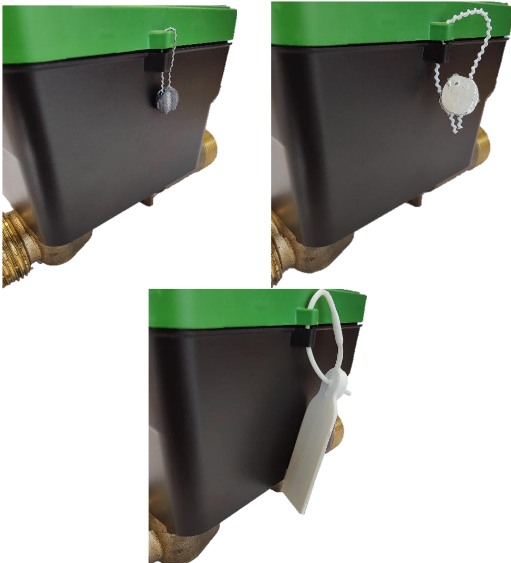
Additional Optional Sealing Provisions