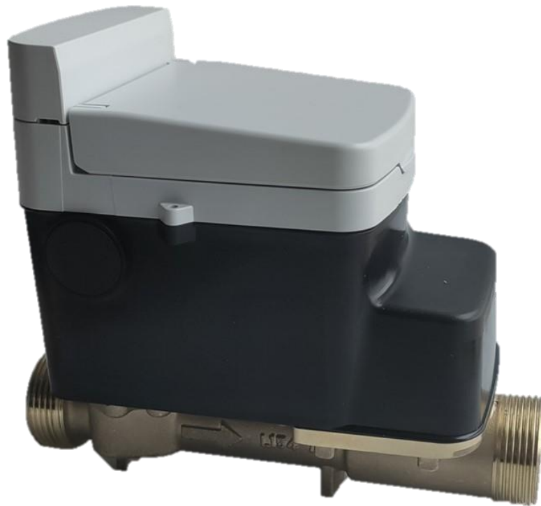
Siconia WM20 NB528 W4AP (pressure and vibration sensors) – Variant 1