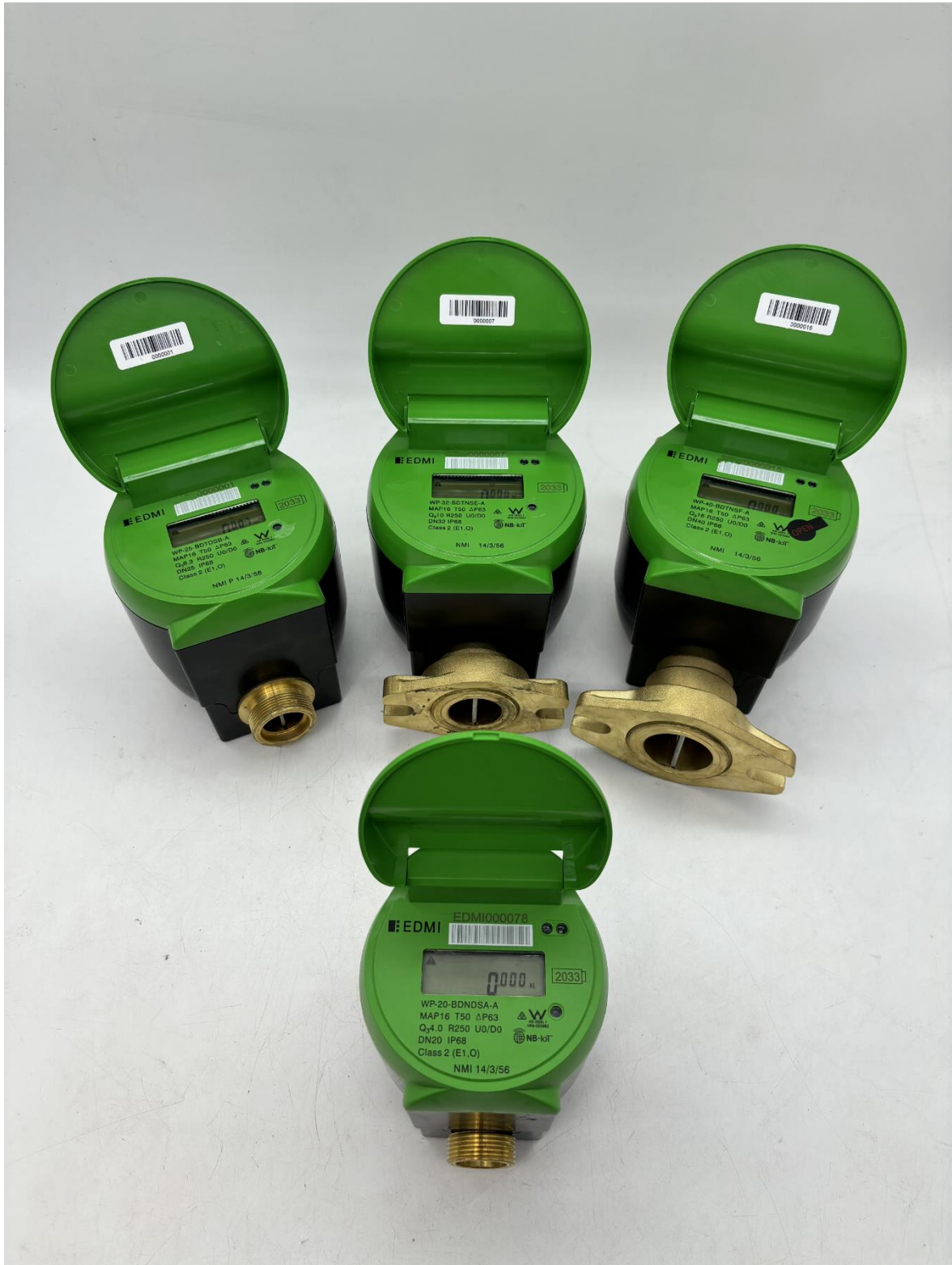
Meter sizes DN25, DN32 and DN40 – Variant 3