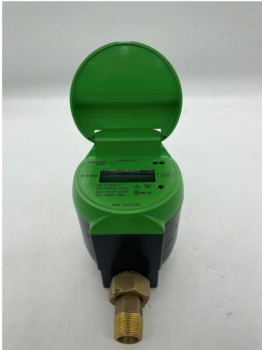
The Pattern - EDM I WP-20-BDND-A model Water Meter