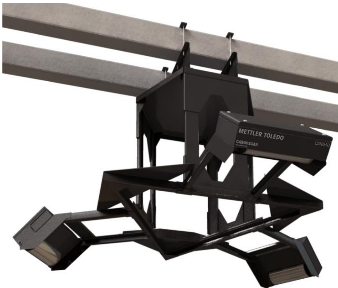
(a) METTLER TOLEDO Model CSN840 Laser Scanners