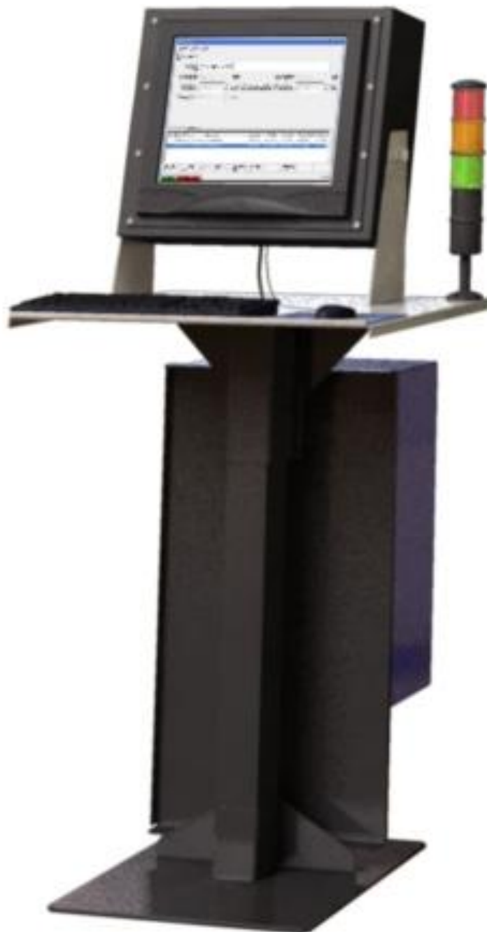
Typical Optional Workstation