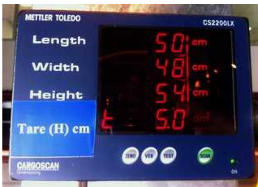
METTLER TOLEDO Model CS2200LX Indicator with the OctoStatic Taring Module including Tare Display (Variant 1)