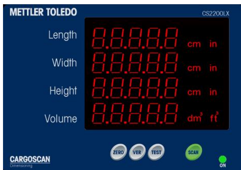
(b) Typical Display of a METTLER TOLEDO Model CS2200LX Indicator