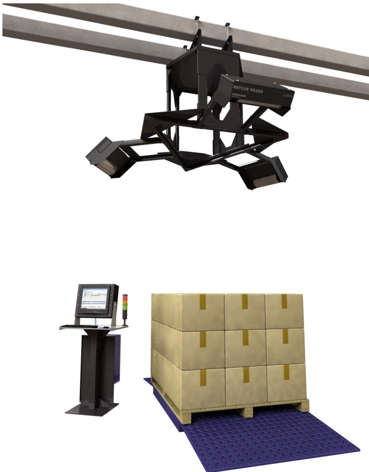
METTLER TOLEDO Model CSN840 Dimensional Measuring Instrument