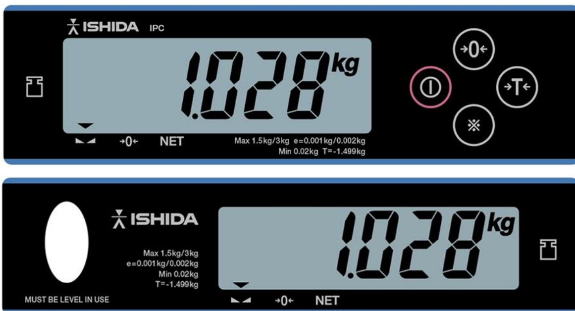
(a) Alternative Layout (For Trading Direct With The Public)