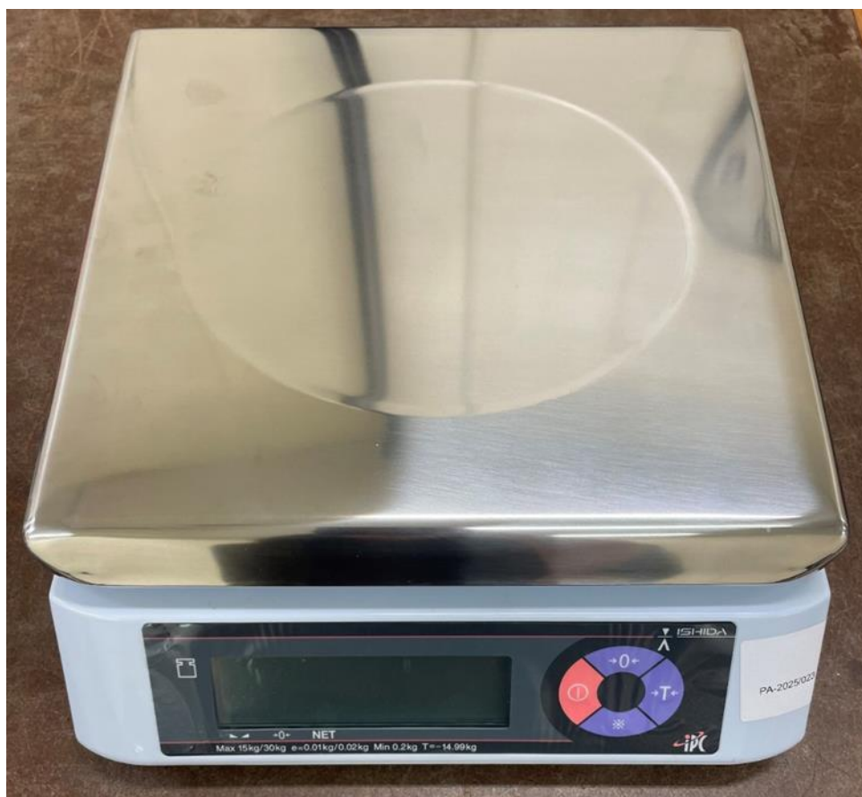
(a) Ishida Model IPC Weighing Instrument (Operator Side)