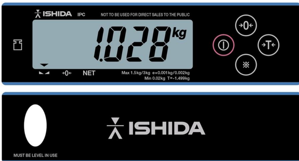
(b) Alternative layout (NOT For Trading Direct With The Public)