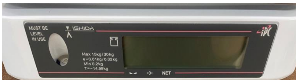
(b) Ishida Model IPC Weighing Instrument (Customer Side)