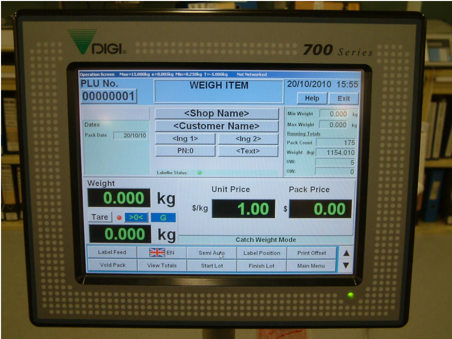
(a) Digi Model 700 Series Terminal/Indicator