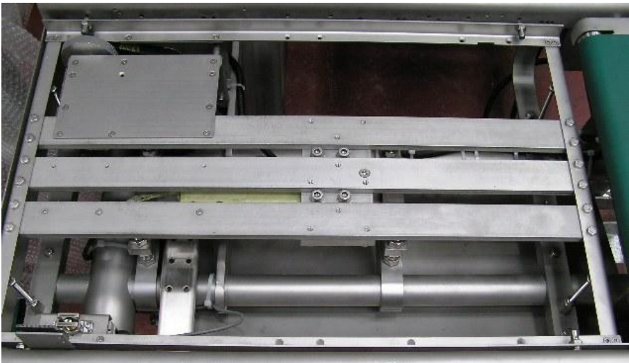
(b) Model WIL-700 – Weighing Unit (Conveyor Removed)