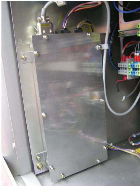
FIGURE 6/14G/24 – 3

Sealing is obtained by screwing the cover plate onto the A/D board box and placing destructible adhesive labels across joins