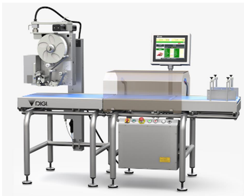
DIGI Model WIL-700 II Automatic Catchweighing Instrument (Variant 2)