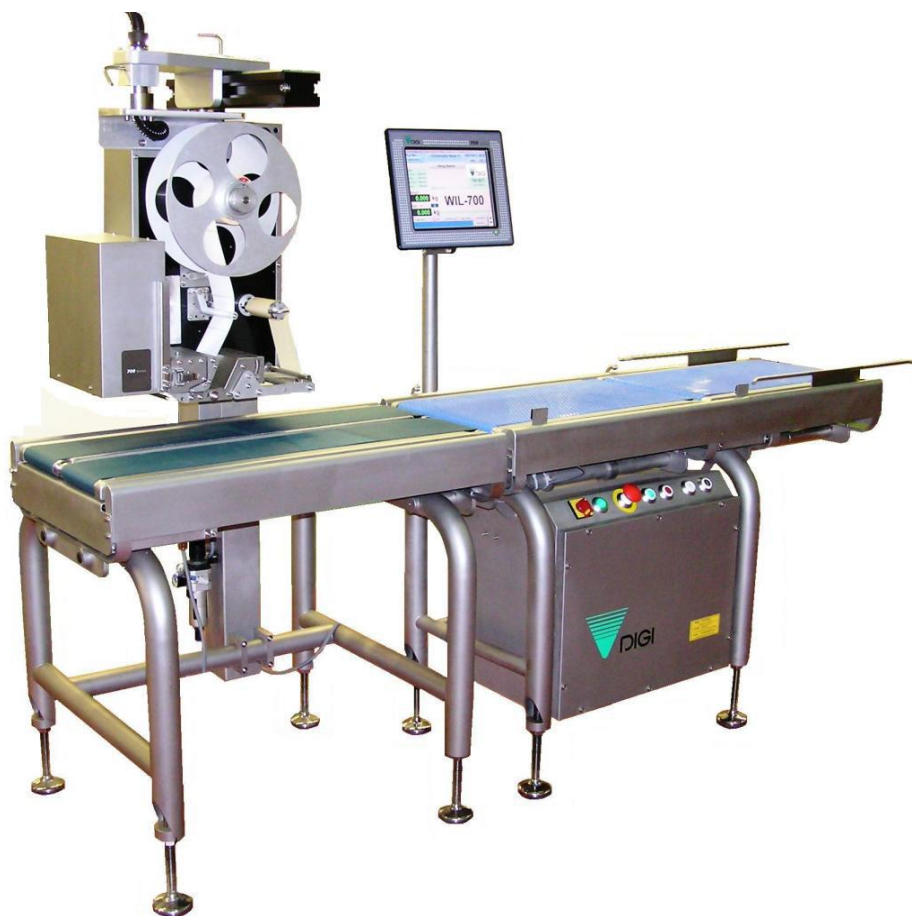
Digi Model WIL-700 Automatic Catchweighing Instrument (Pattern)