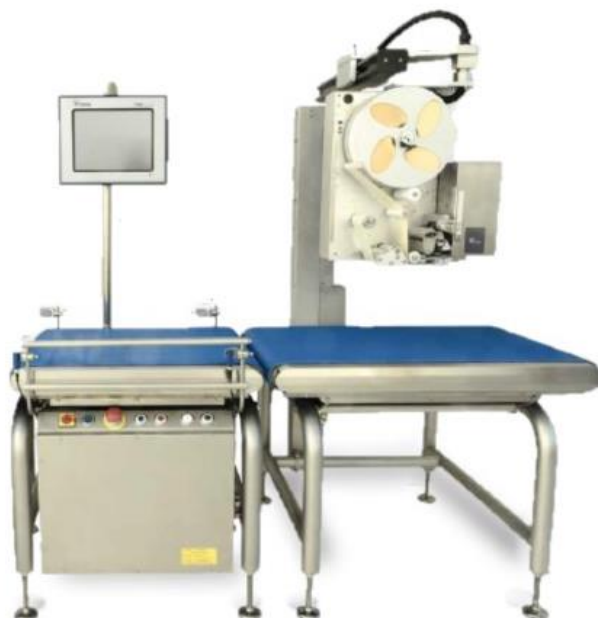
DIGI Model WIW-700 II Automatic Catchweighing Instrument (Variant 3)