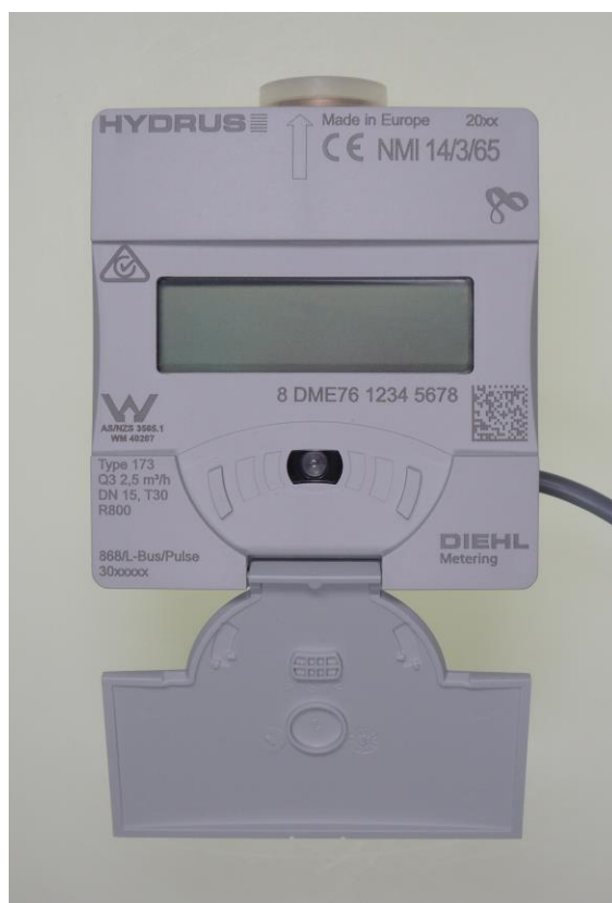
Indicating device and example of required markings