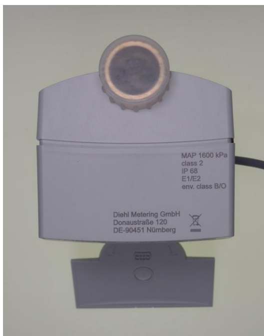
FIGURE 14/3/65 – 3

Example of required markings (continued) on side of case