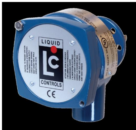
Liquid Controls Model PODx Pulse Generator