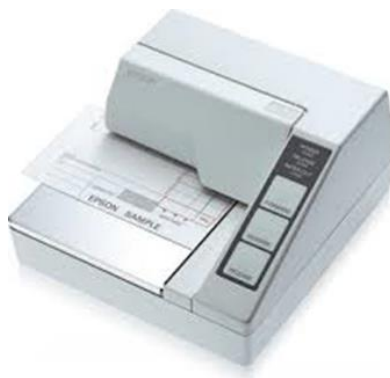
Epson Model TM-295 Printer