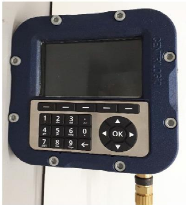
Liquid Controls Model LCRx.iQ Calculator/Indicator (Variant 1)