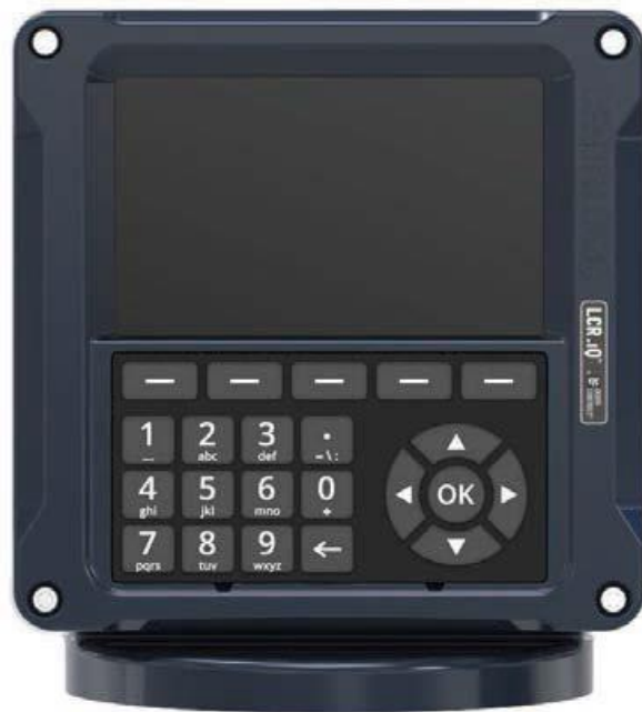
Liquid Controls Model LCR.iQ Calculator/Indicator