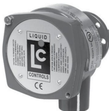
Liquid Controls Model PODx Pulse transmitter