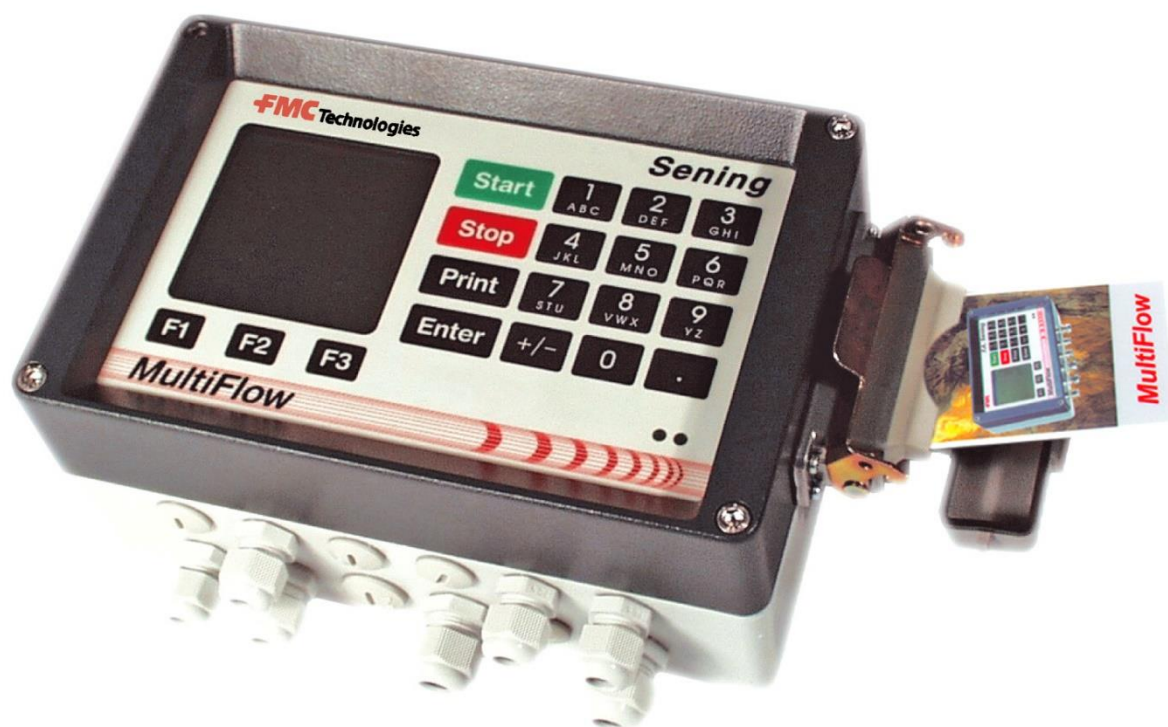
FMC F.A. Sening Model MultiFlow Calculator/Indicator