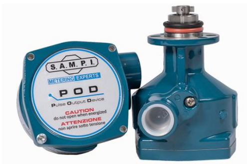
Sampi Model POD Pulse transmitter