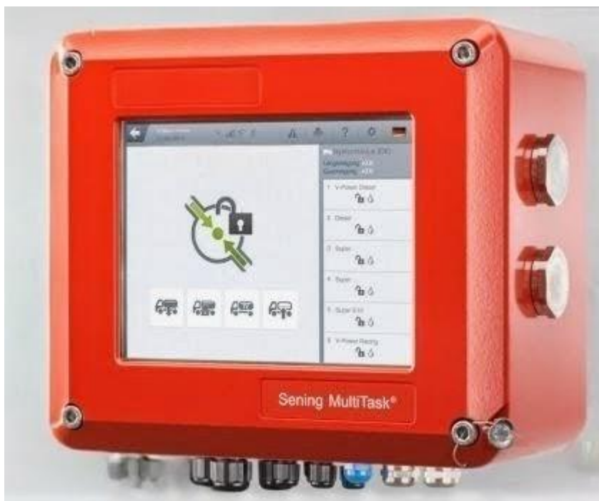
FMC F.A. Sening Model MultiTask MT-E calculator/indicator