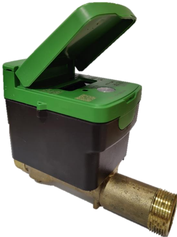
Siconia WM20-NB28 W2P (Front View) – the Pattern