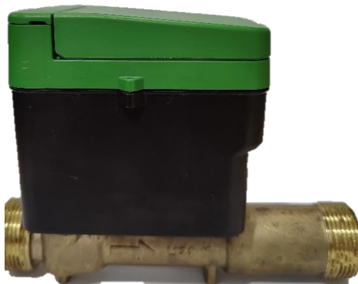
Siconia WM20-NB28 W2P (Side View) – the Pattern