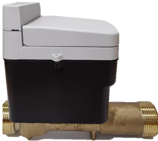
WM20-NB528 W3P (Side View) – Variant 1