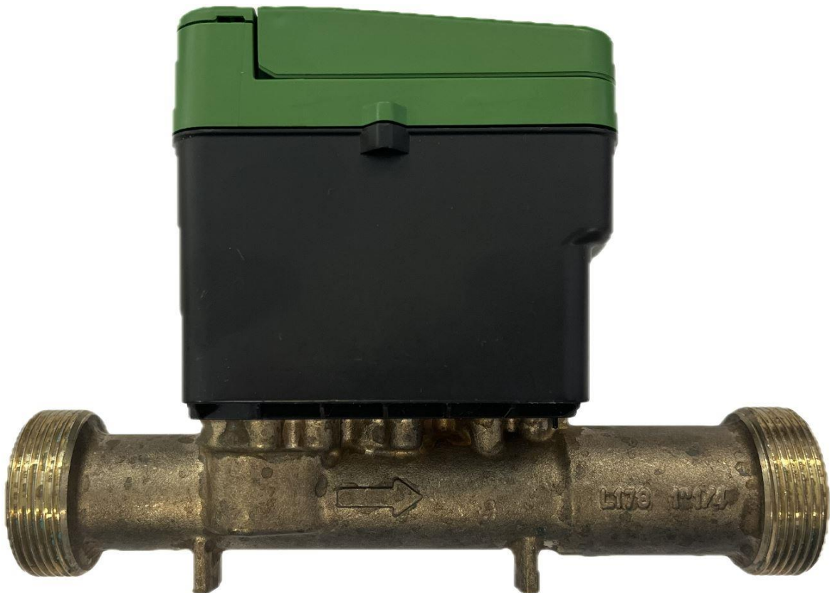
Siconia WM25 NB28-W2P – Variant 2