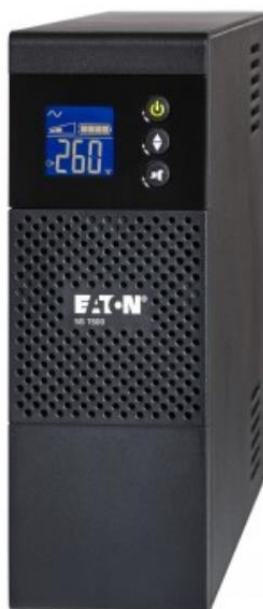
Eaton 5S Line Interactive SOHO UPS 1200VA / 750W LCD UPS