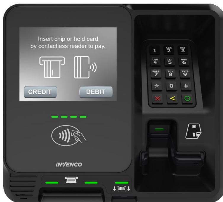
Inenco Model G6-300 (Variant 2)