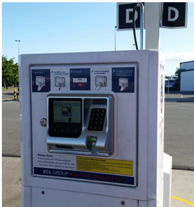
Typical Invenco Model G6 6525X Stand-alone Control System (Variant 1)