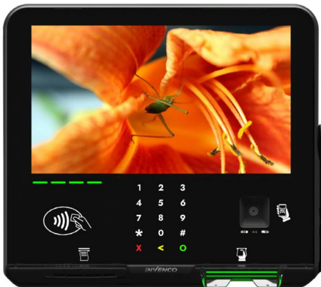
Inenco Model G6-400 (Variant 3)