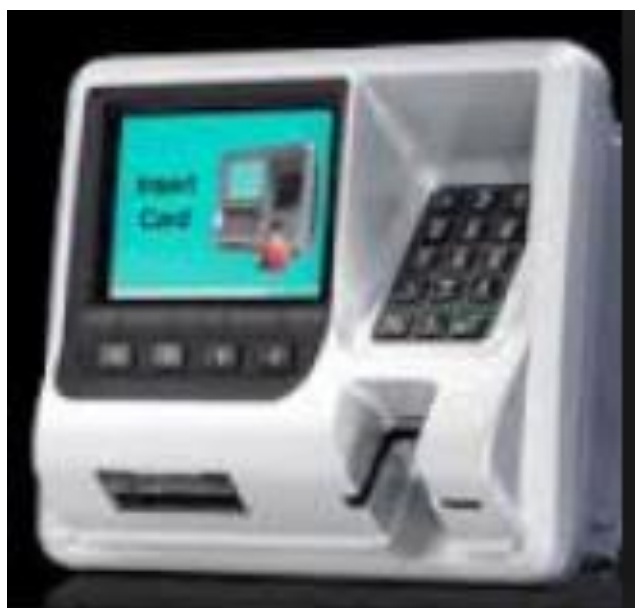
Typical Invenco Model G6 6525X Payment Terminal