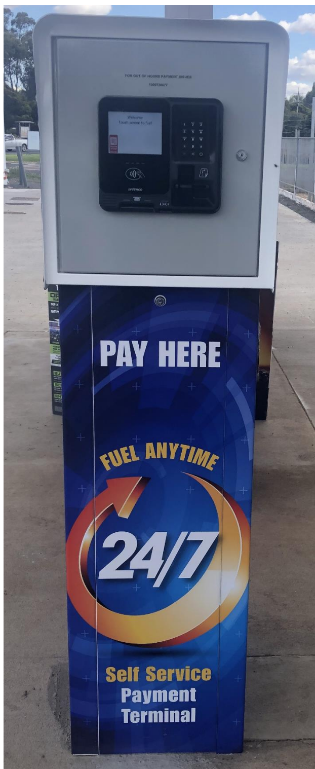
Typical Invenco Model G6-300 Stand-alone Control System (Variant 2)