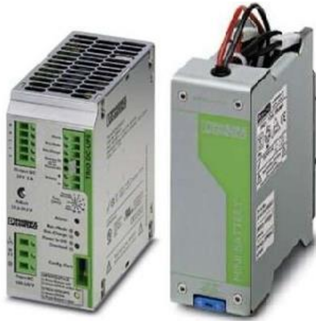
Phoenix Contact TRIO-uninterruptible power supply