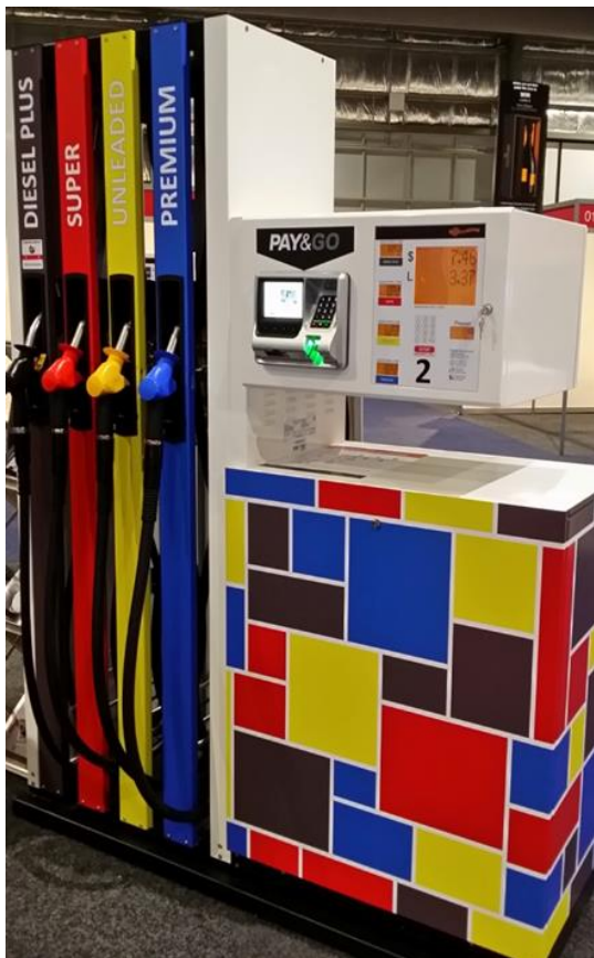
FIGURE S683 – 3