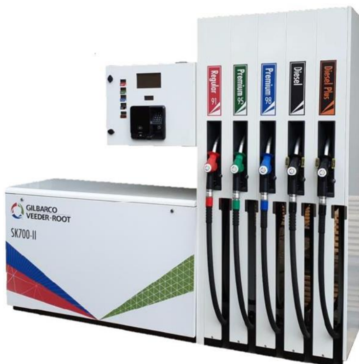
Inenco Model G6-300 installed in Gilbarco SK700-2 Fuel Dispenser (Variant 2)