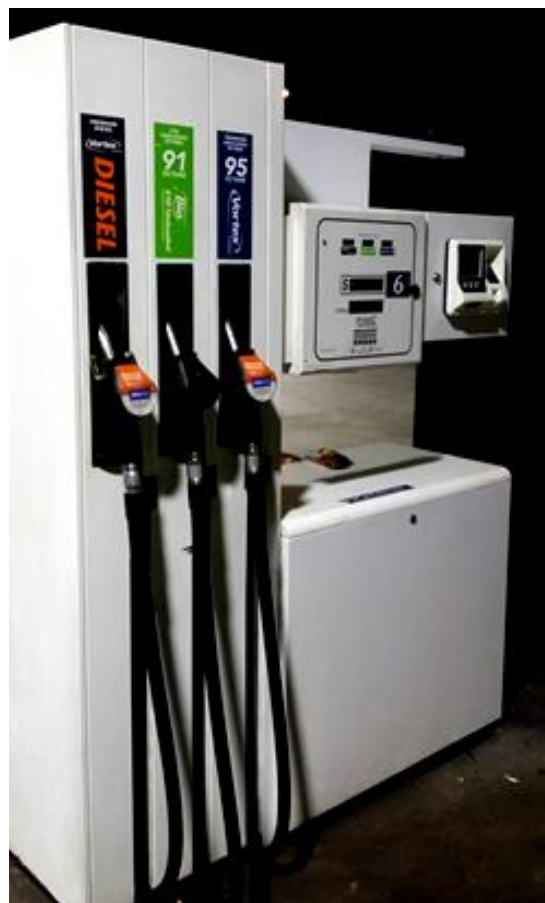
Typical Invenco Model G6 6525X Terminal Installations in Various Fuel Dispensers