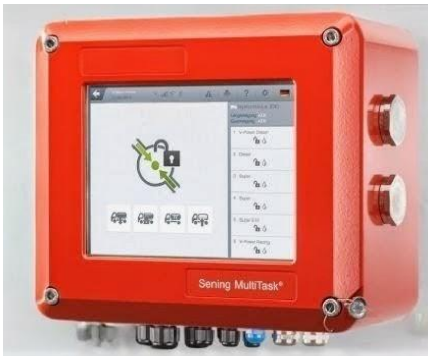
FMC F.A. Sening Model MultiTask MT-E calculator/indicator