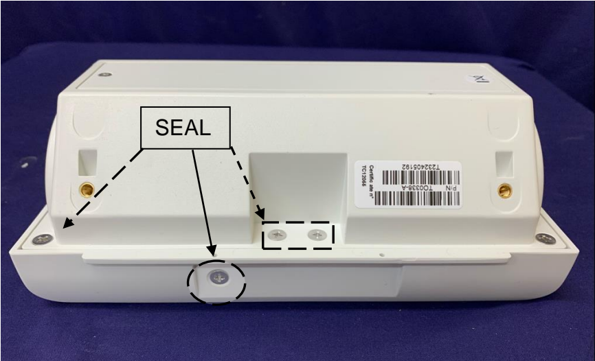
Sealing of Bilanciai Model D70E Indicator