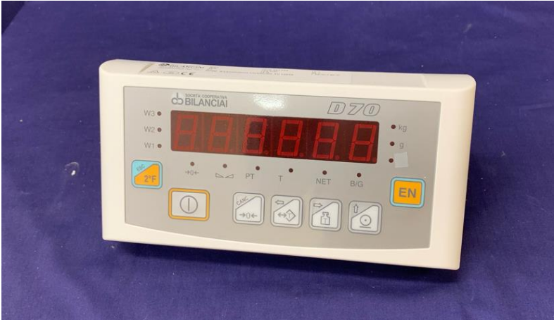
Bilanciai Model D70E Digital Indicator