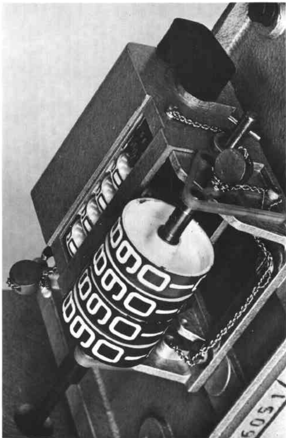
Counter and Sealing Arrangement