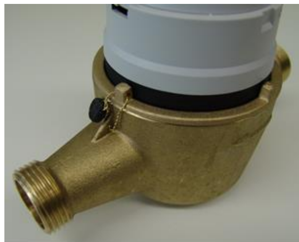
Wire sealing provision