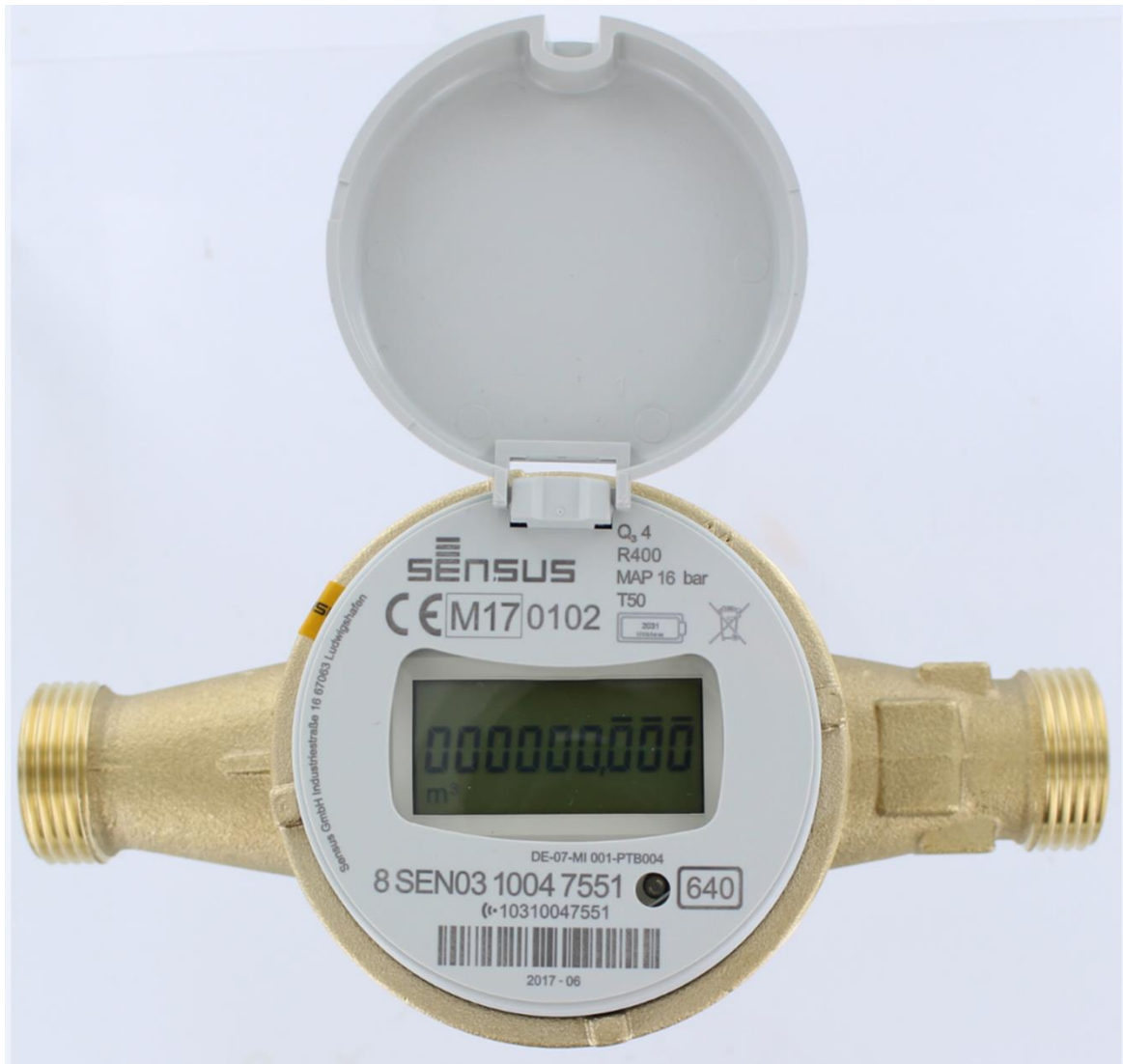
Variant 2 showing the Electronic Indicating Device