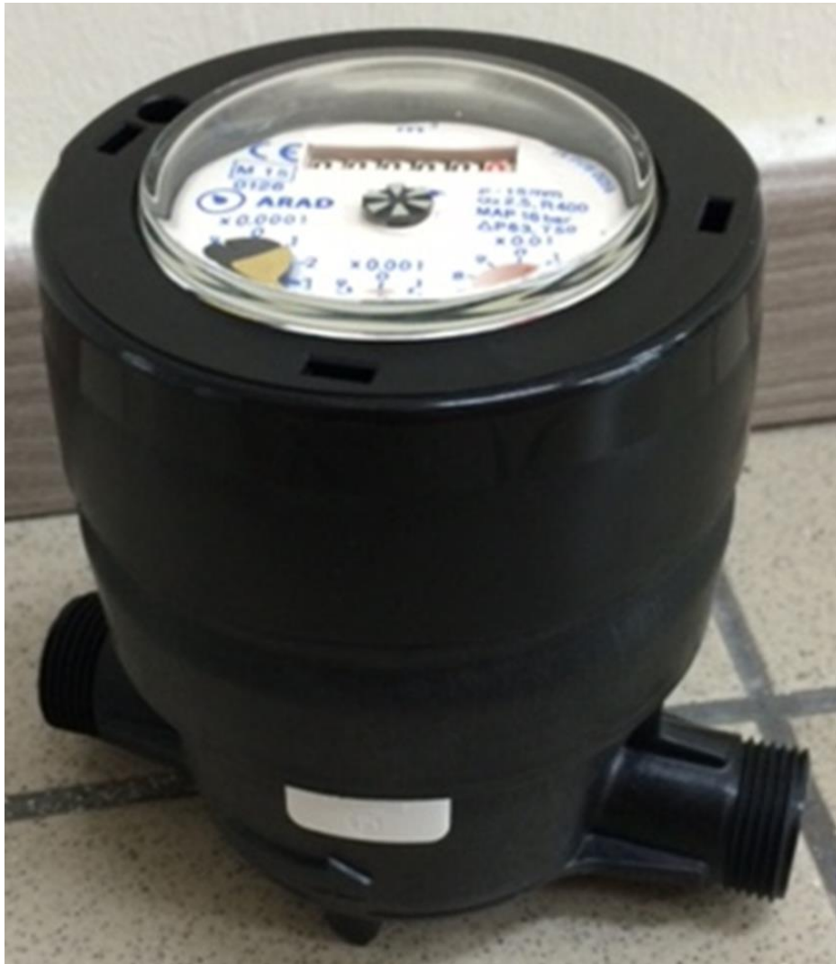
FIGURE 14/3/31 – 1