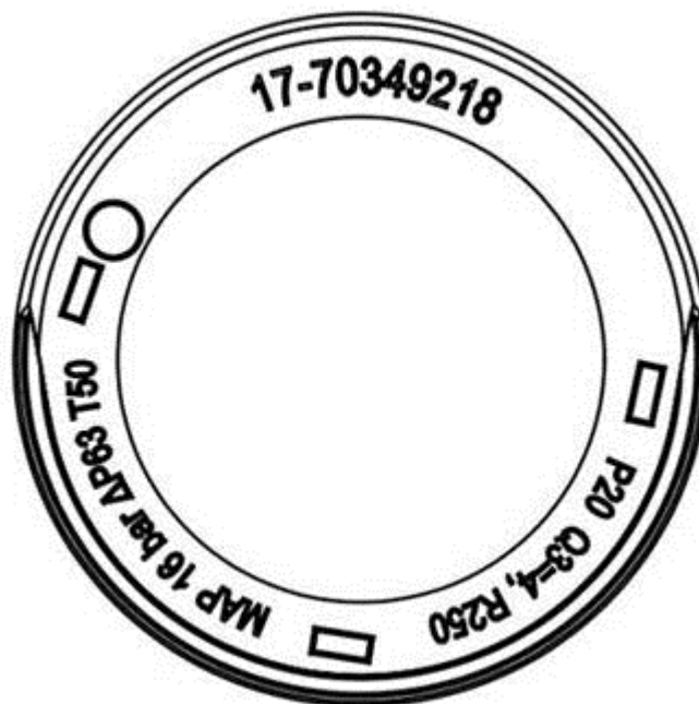
Alternative marking arrangements – dial plate and meter casing