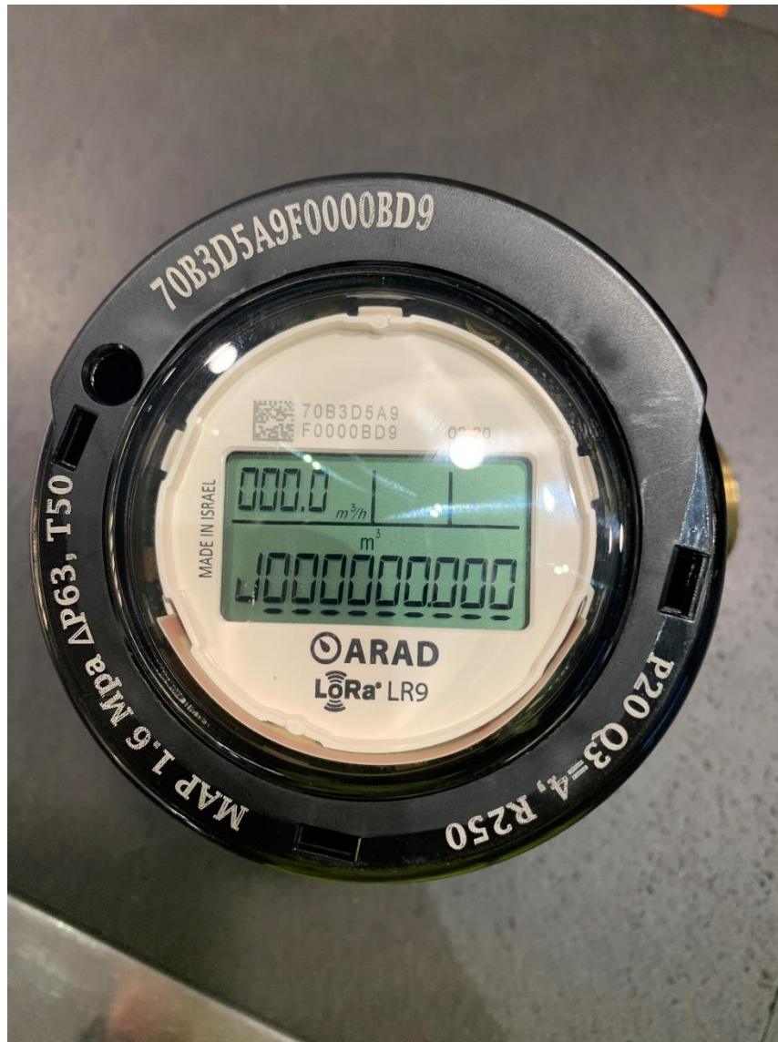
LR (LoRa) Type Digital Register