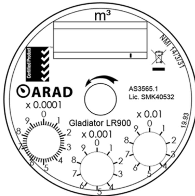
FIGURE 14/3/31 – 2