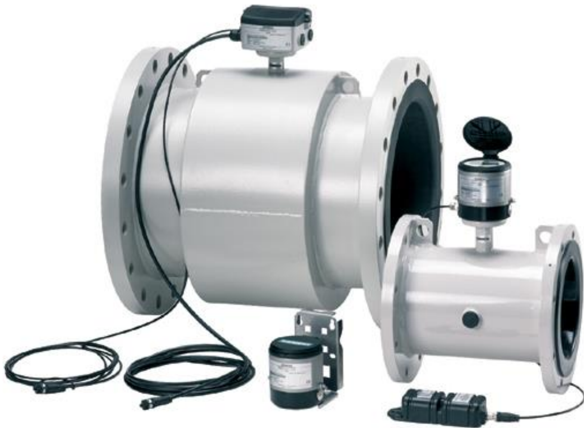
Showing Two Different Size Meters MAG8000 (Various Variants) And in 'Compact' and 'Remote' Arrangements (Variant 8)