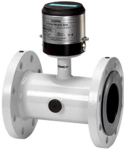
(a) Siemens Model MAG 8000 DN50 Water Meter (Pattern)