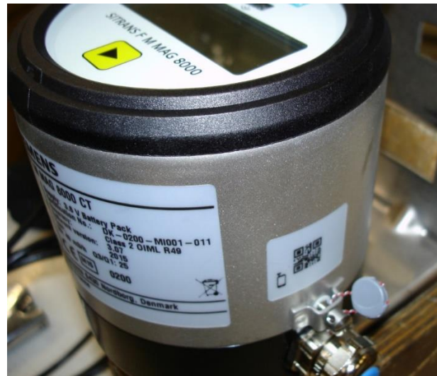
Typical Mechanical Sealing of MAG8000