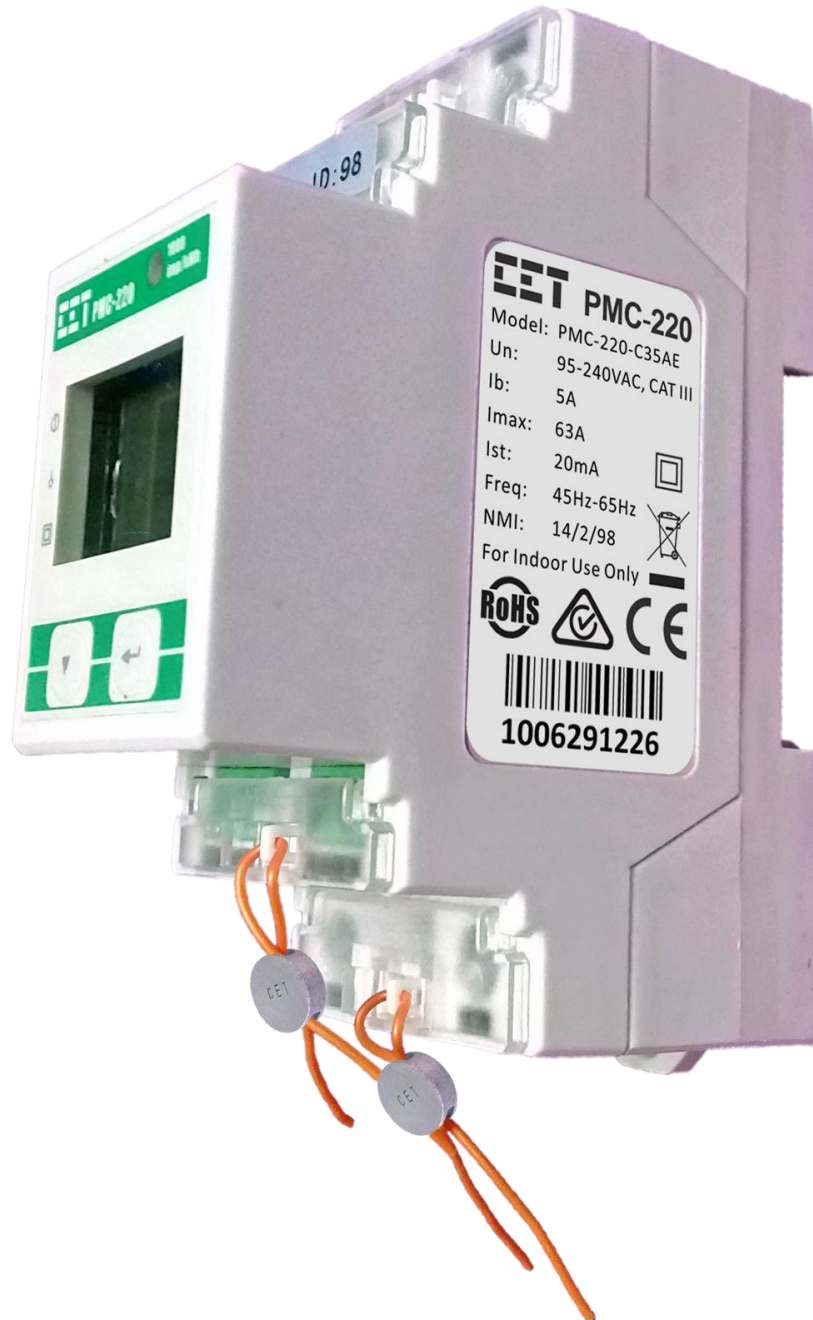
CET ELECTRIC TECHNOLOGY INC. model CET PMC-220-C35AE Electricity Meter Showing Markings