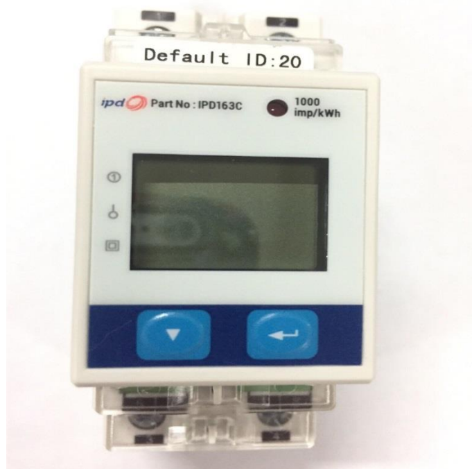
Variant 1 - CET ELECTRIC TECHNOLOGY INC. model IPD 163C Electricity Meter