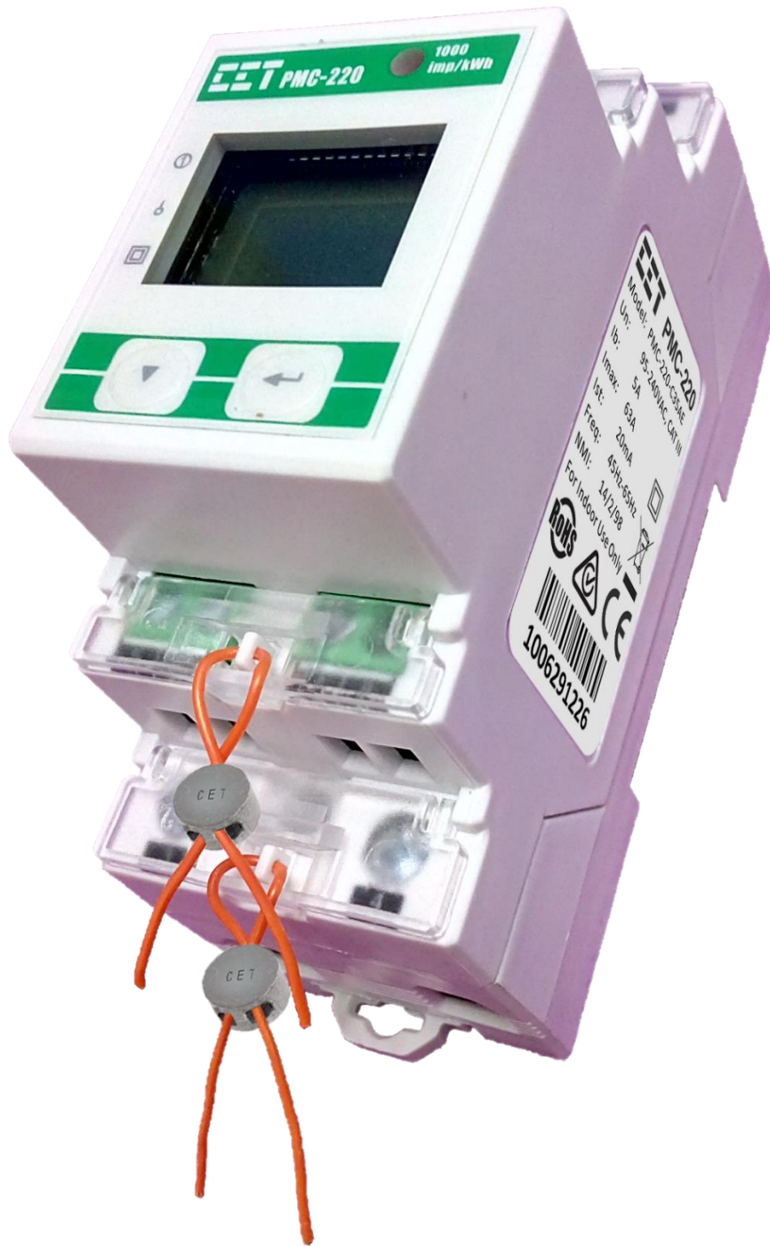
CET ELECTRIC TECHNOLOGY INC. model CET PMC-220-C35AE Electricity Meter Including Typical Mechanical Sealing