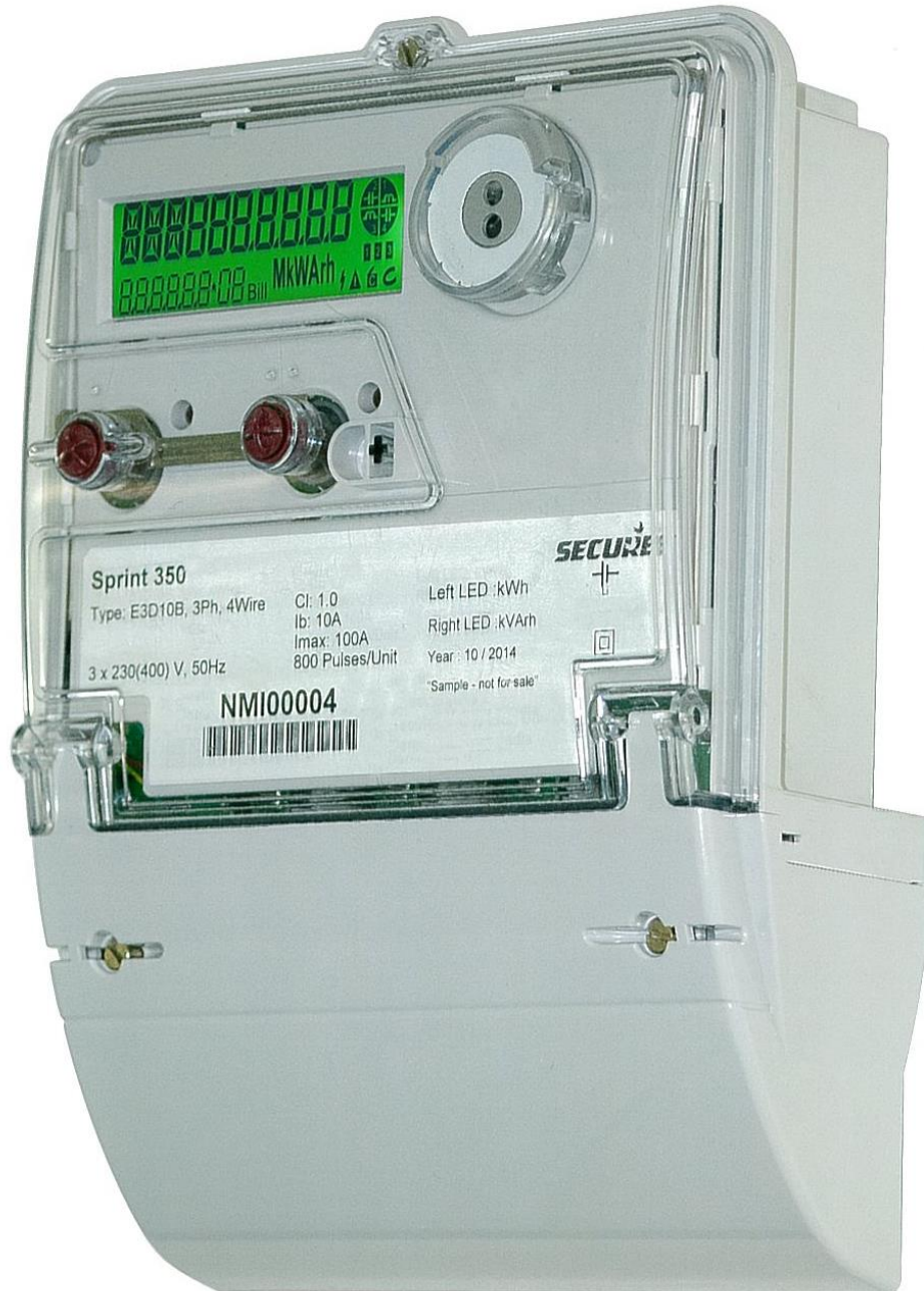
Secure Model Sprint 350 Electricity Meter