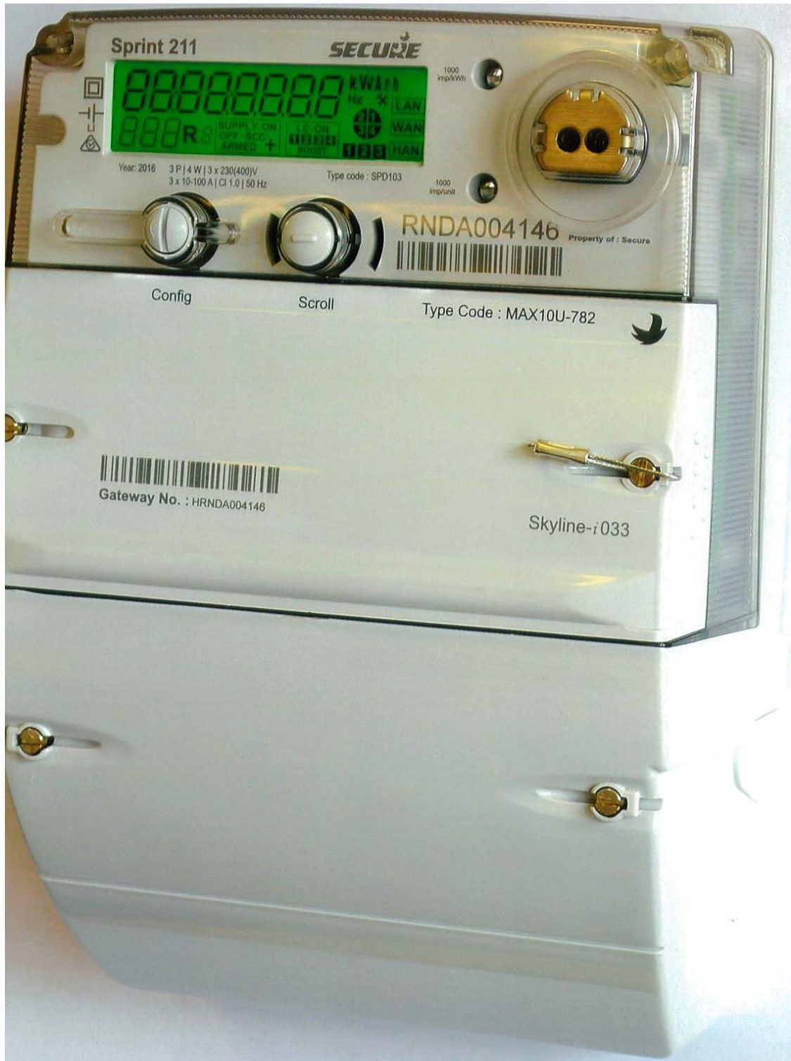
Secure Model Sprint 211 Electricity Meter (Variant 1)