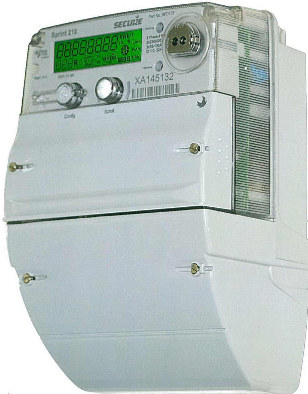
Secure Model Sprint 210 Electricity Meter (The Pattern)