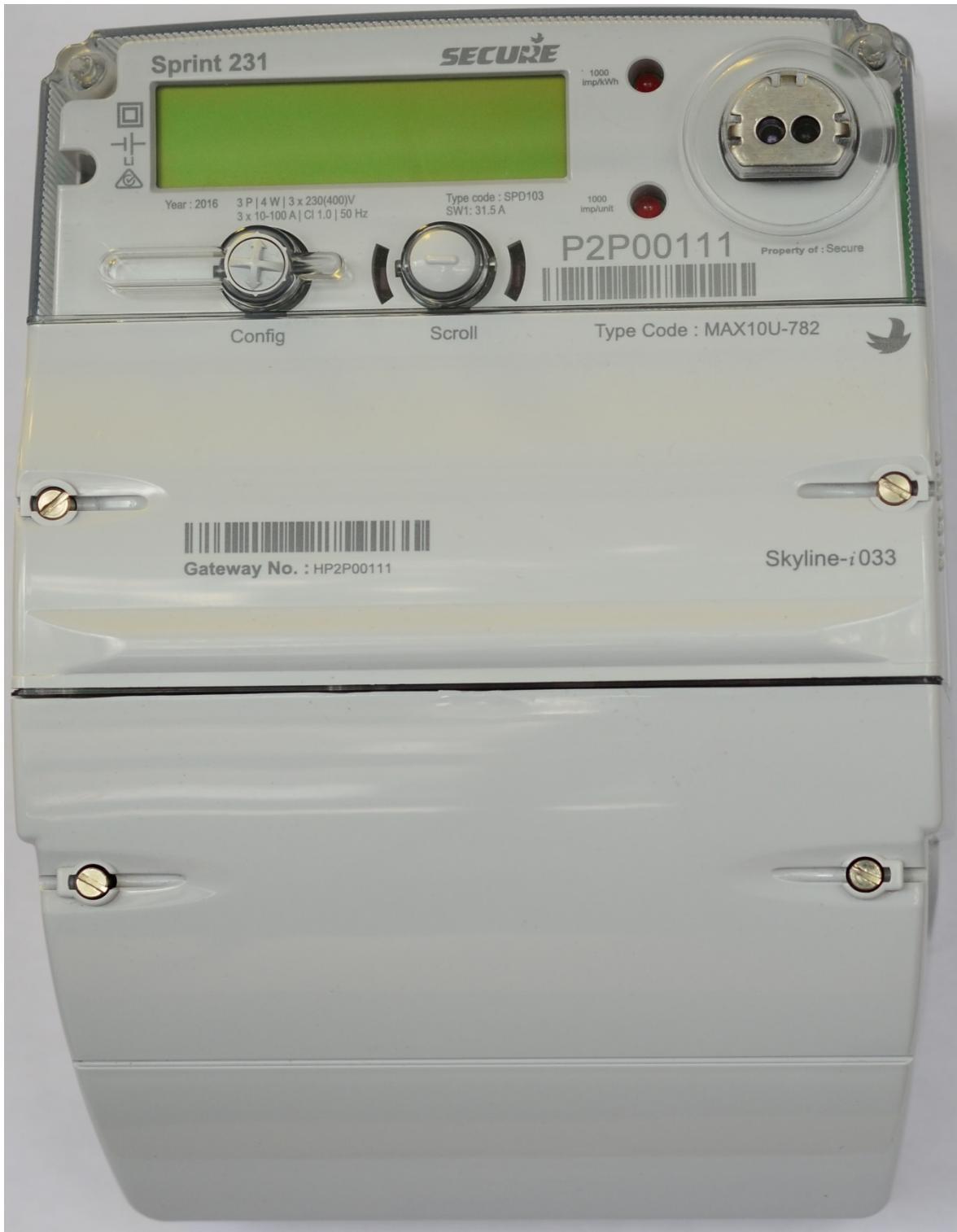
Secure Model Sprint 231 Electricity Meter (Variant 2)