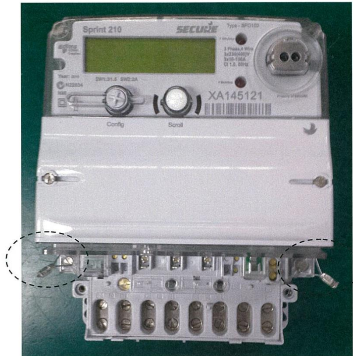
FIGURE 14/2/83 – 2