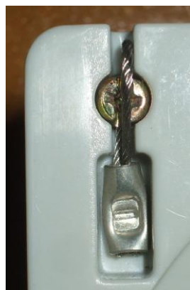
Typical Mechanical Sealing