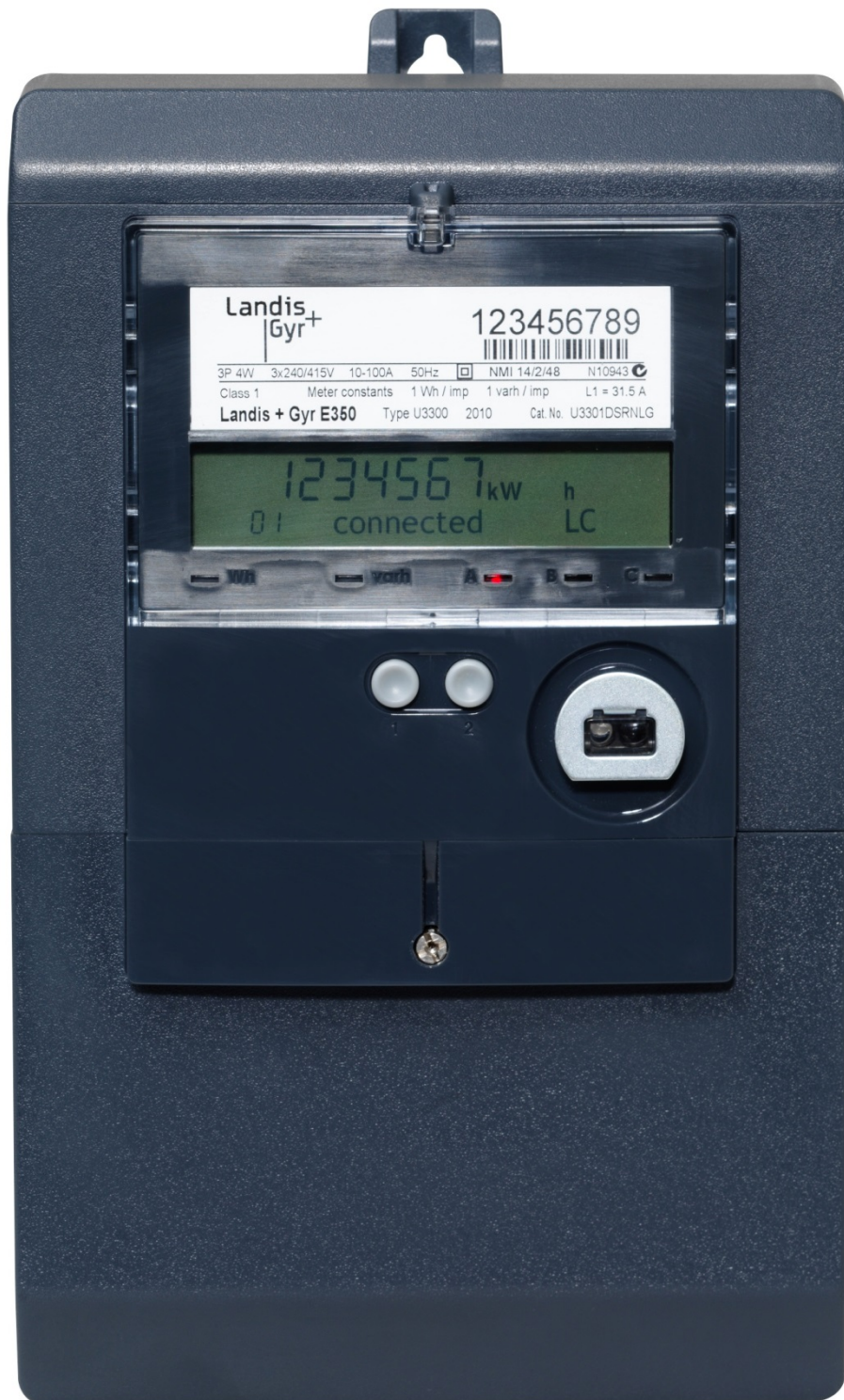
Landis+Gyr model E350 Type U3300 Electricity Meter (Pattern)