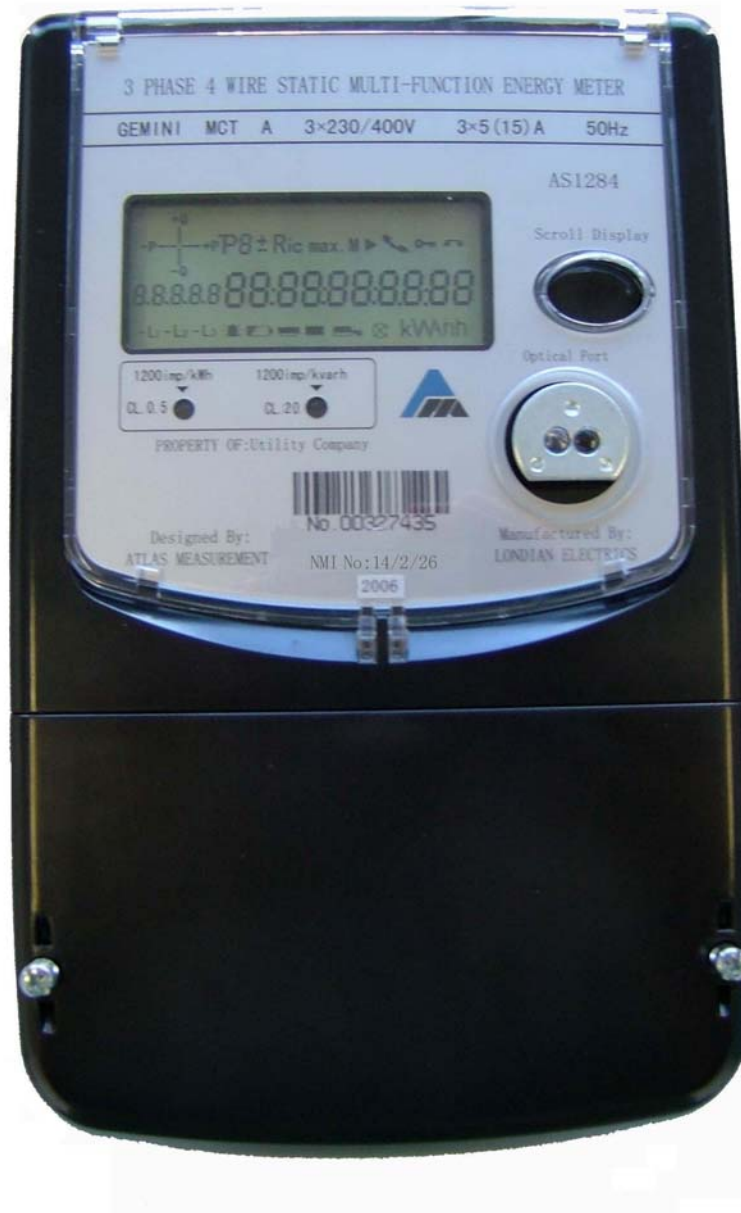
Atlas Measurement Model GEMINI MCT A Indoor Electricity Meter