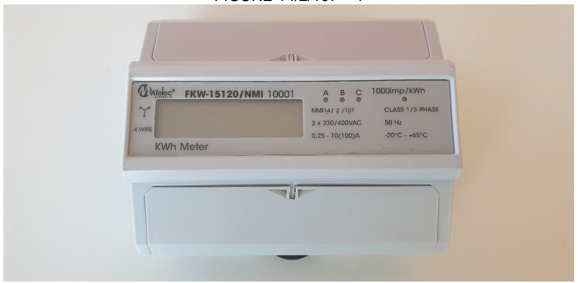
FIGURE 14/2/107 - 1

Montreaux/MATelec Meters Limited model FKW-15120 Electricity Meter (The Pattern)