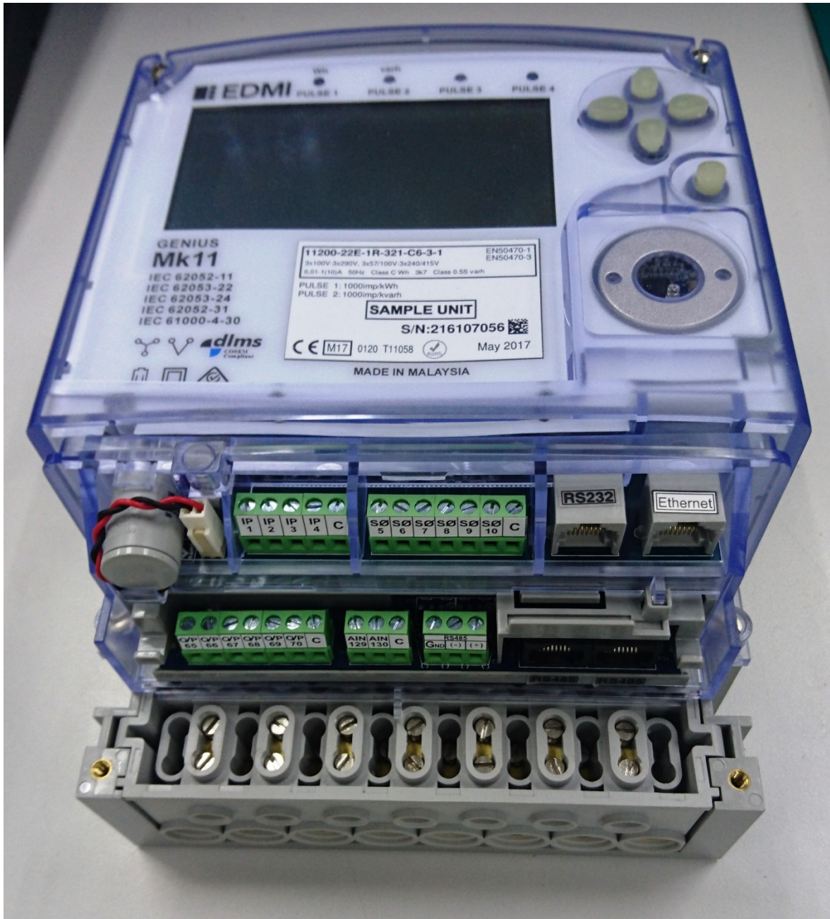
EDMI model Genius Mk11 CT Electricity Meter displaying terminal connections