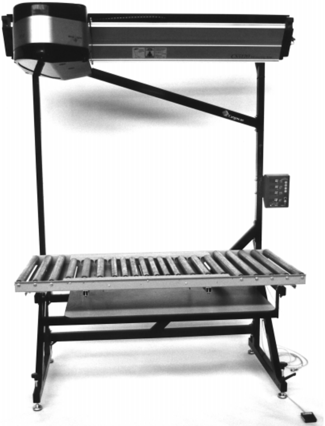
Model CS5120 With Roller Conveyor Receptor