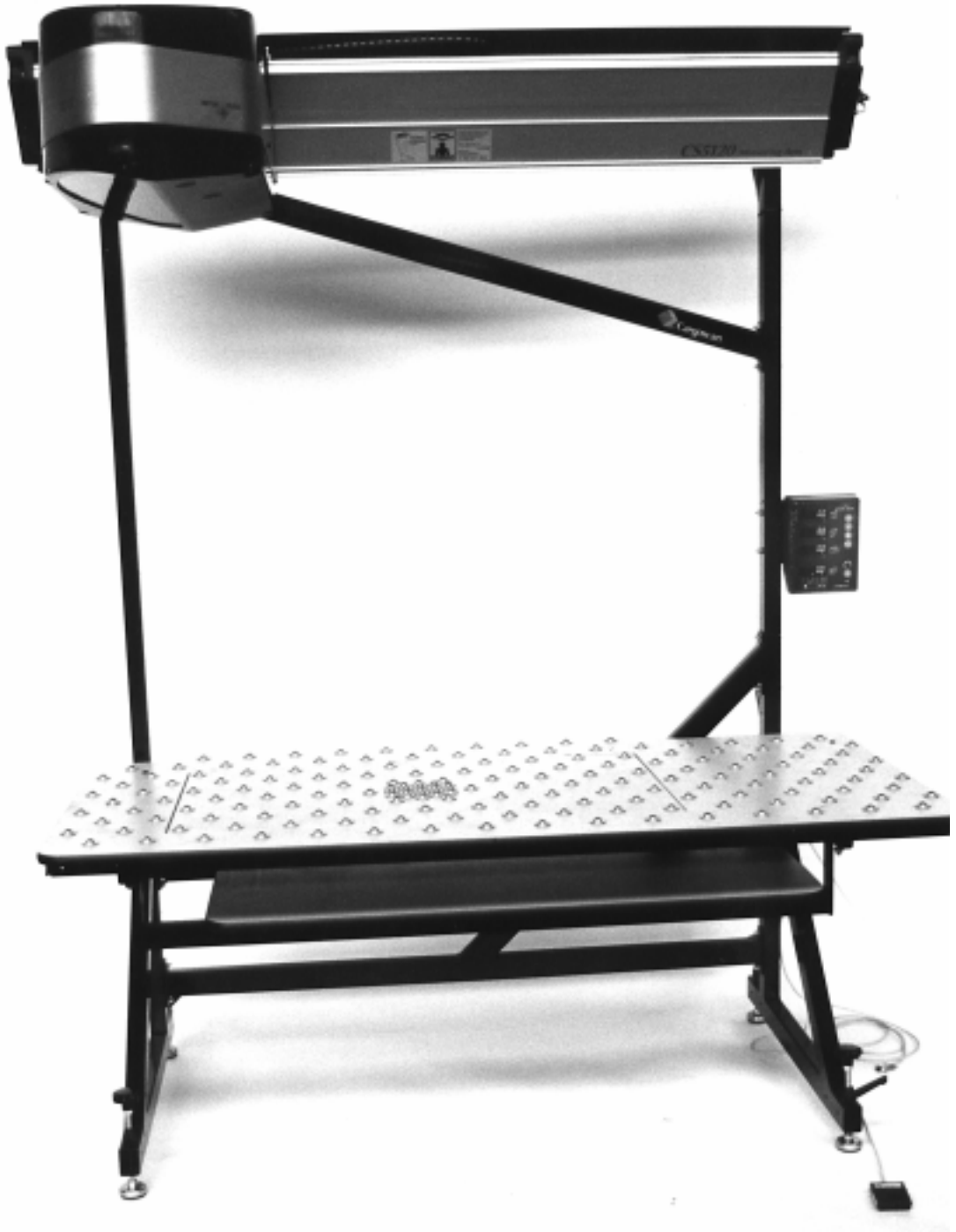
Model CS5120 With Ball-top Receptor