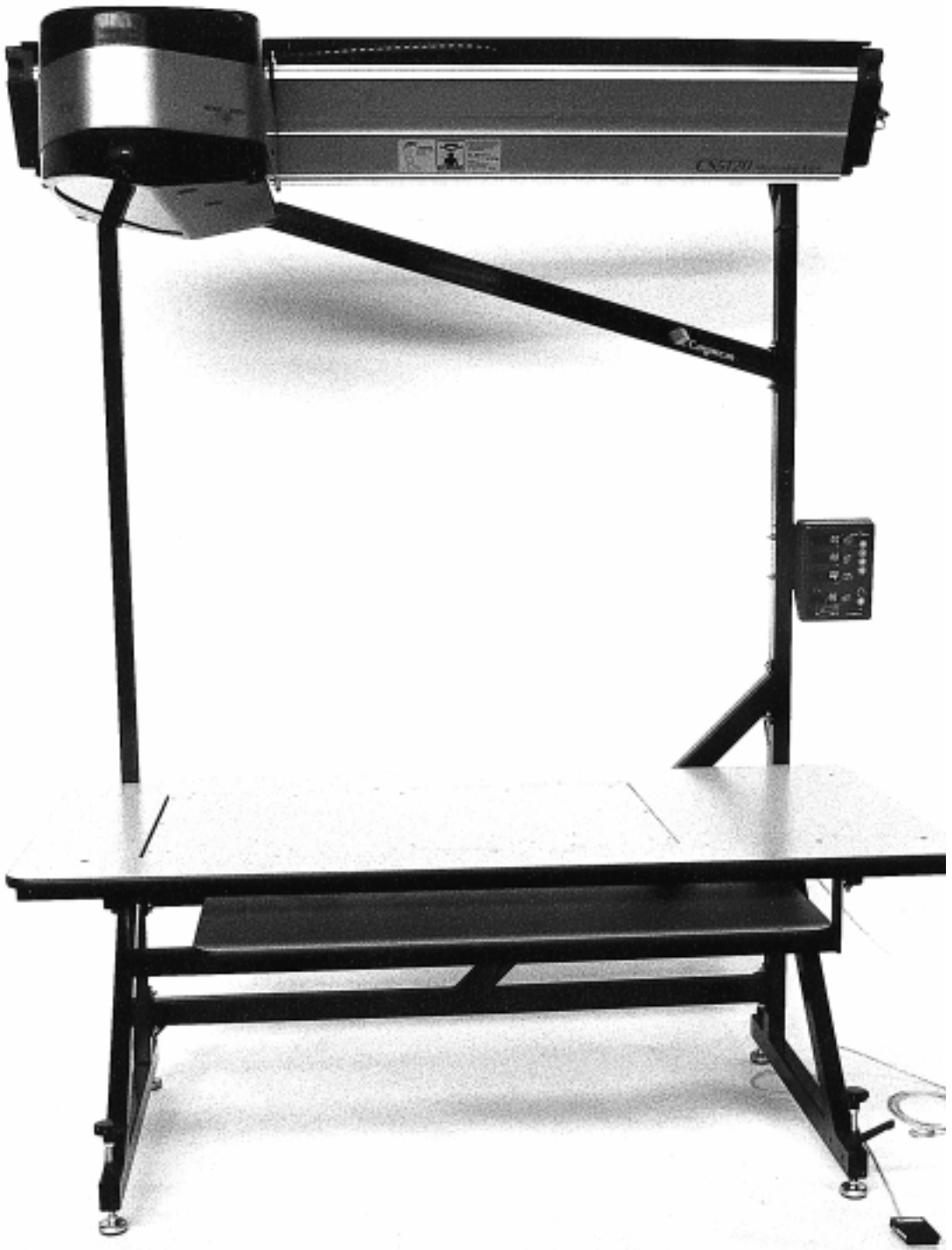
Cargoscan Model CS5120 With Flat Surface Receptor