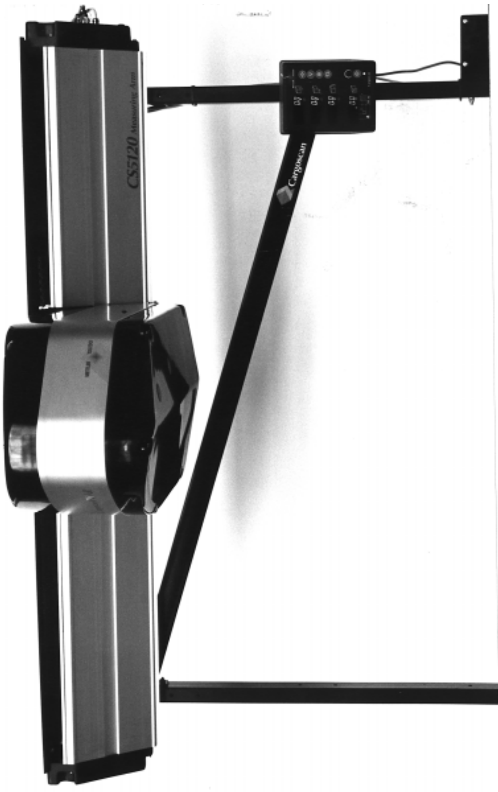
Showing Measuring Head and Indicator/Control Panel