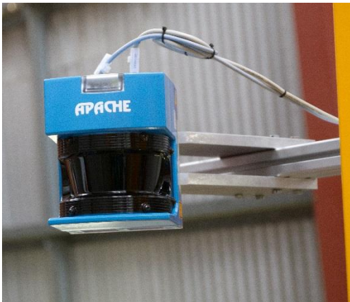
(a) Laser Measuring Scanner