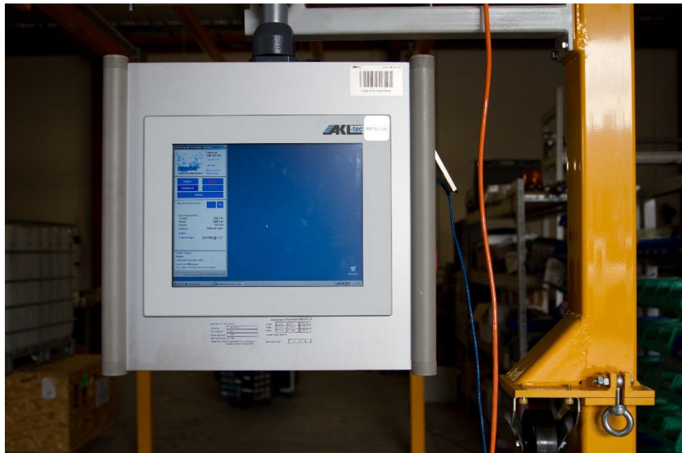
(b) AKL-tec Model "emPC-MCD" Personal Computer