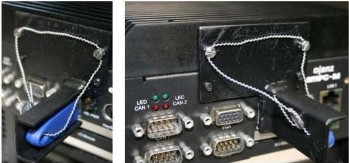
Sealing of USB Port Cover Plate and Checksum Dongle