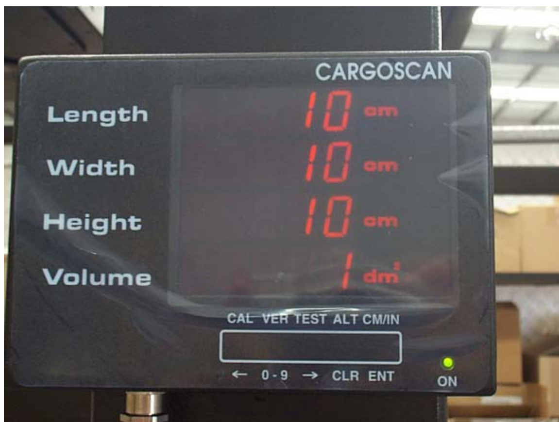
Cargoscan Model CS2200 Indicator/Control Panel