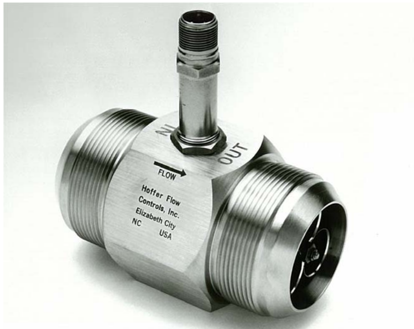
Hoffer Model HO* Flowmeter