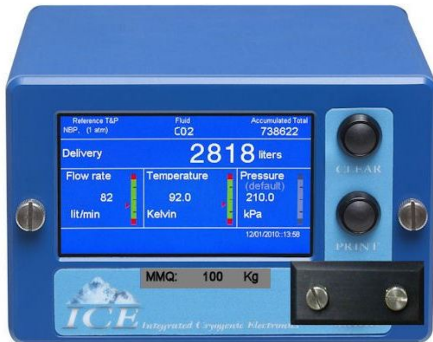
Hoffer Flow Controls Model ICE-2T- X-24-X-S-SG-X Calculator/Indicator