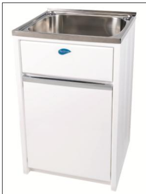
Nugleam Supreme – 45 Lt stainless steel lipped laundry bowl fitted to an Australian made polymer cabinet. Sold as a free standing unit.

The pictures below show the differences between a Lipped SS Laundry Tub Bowl which is assembled with Australian-made cabinets into standalone laundry units and a bench top laundry sink.