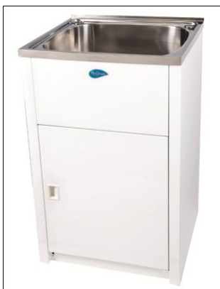
Nugleam Standard – 45Lt stainless steel lipped laundry bowl fitted to a powder coated metal cabinet. Sold as a free standing laundry unit.