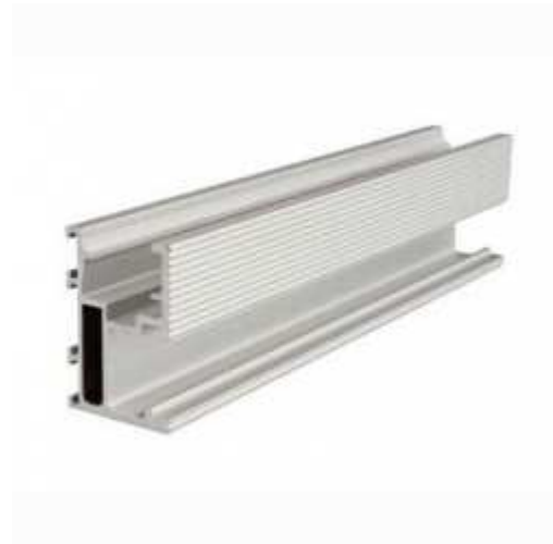
Pair of Clenergy ezRack Rails - 2 x 4200mm

http://www.rpc.com.au/catalog/clenergy-ezrack-rail-kit-4200mm-p-3595.html