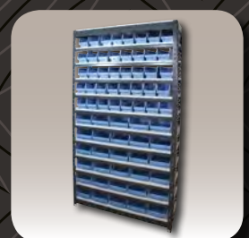
Rivet Bin Shelving