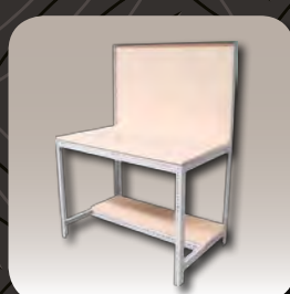
Handy Angle Work Bench