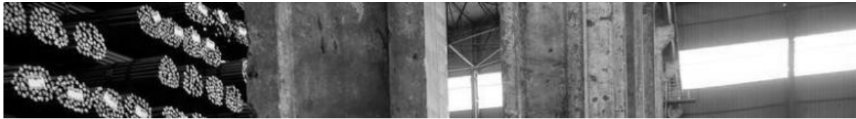
China will maintain tax rebate policy for steel exports