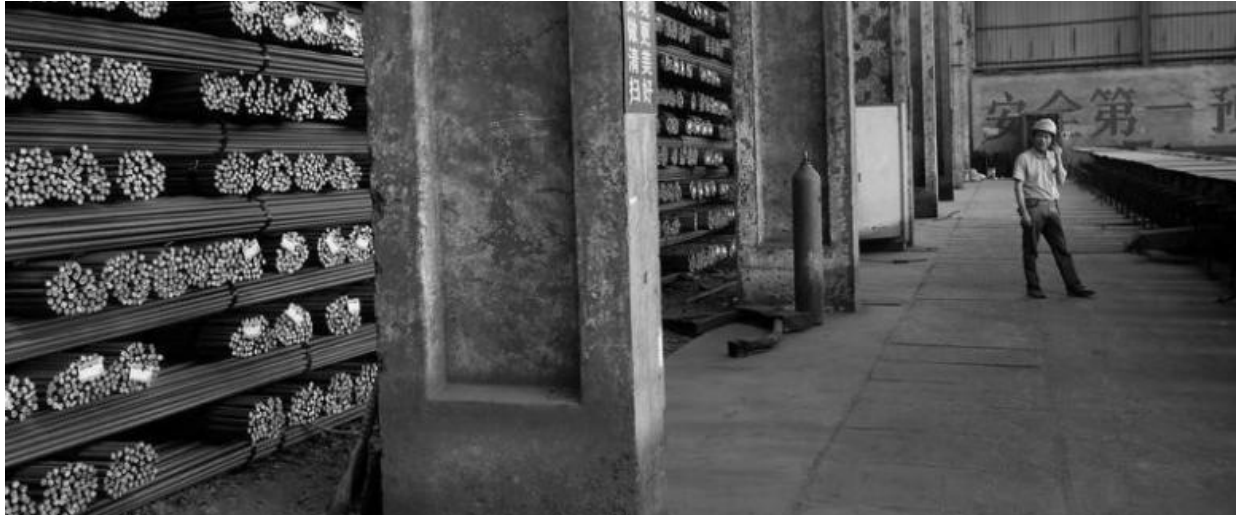
An employee talks on his mobile phone near stacks of rebar at Shanxi Zhongsheng Iron and Steel in Fenyang, Shanxi Province, China, April 28, 2016.