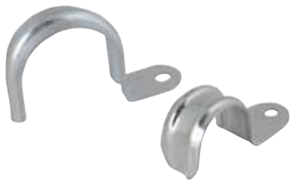
1 Hole Steel Saddles (Hot Dipped Galvanised)