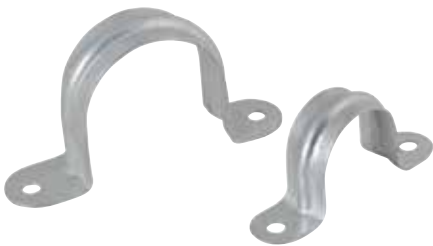
2 Hole Steel Saddles (Hot Dipped Galvanised)