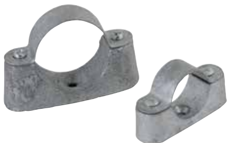
2 Hole Steel Saddle with Spacer (Hot Dipped Galvanised)