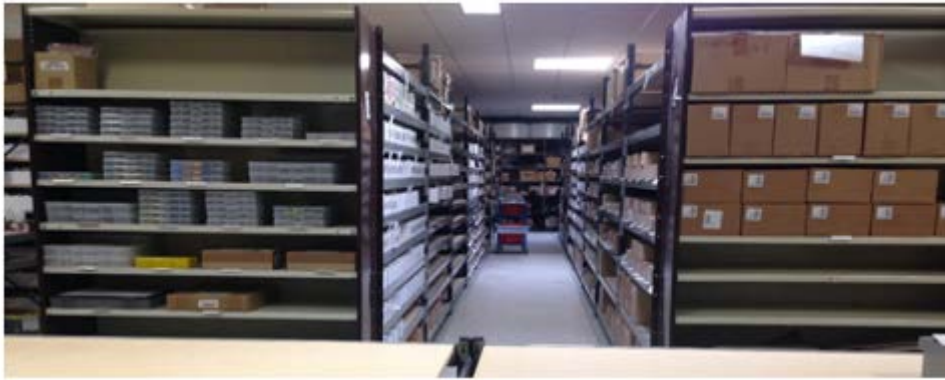
Figure two: industrial shelving system