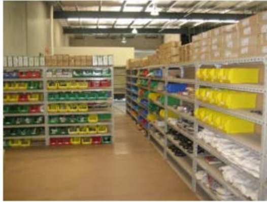
Figure 7: shelving made from slotted angle steel (excluded from the application)

I trust the above information is of use to the Commission and other interested parties to the investigation. Please do not hesitate to contact me should you require further information.