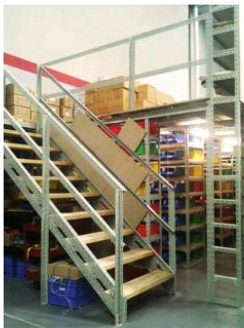
Figure 6: stairs made from slotted angle steel