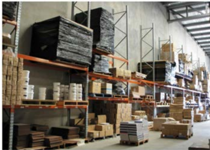
Figure 3: industrial shelving system