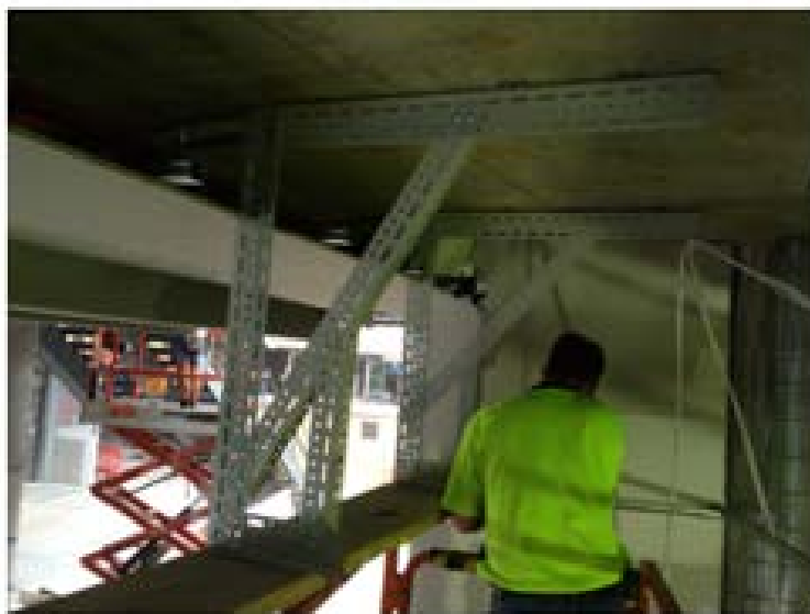
Figure 5: slotted angle steel used as bracing in a construction application