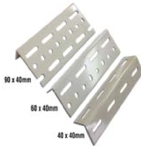
Figure 4: slotted angle steel