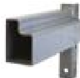
Stepped Heavy Beam