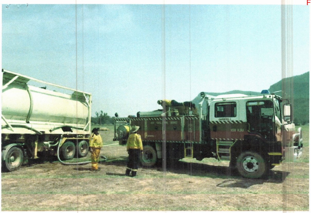
The Capertee RFS unit filling up its truck from a bulk water tanker during the 2019/20 bushfire season.