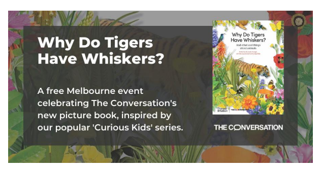
Today's new sletter supported by The Conversation

\itap4Deputy Editor, Science and Technology