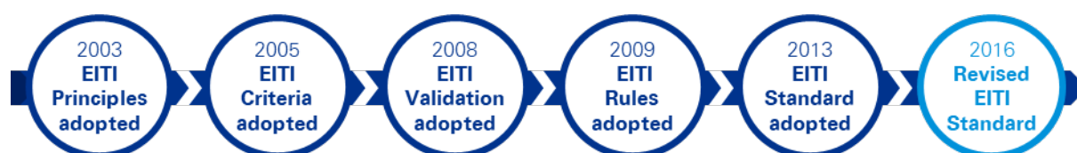
Figure 1: The evolution of EITI Policy

In addition to the regular development of EITI policy, the International EITI Board is regularly called upon to make decisions that clarify various aspects of the 2016 EITI Standard. This policy making process is then complemented with the provision of extensive and detailed guidance that is continuously updated by the International EITI Secretariat, principally through EITI Guidance Notes on various topics (at time of writing 29 such Guidance Notes exist). 3